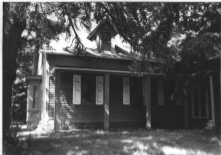
View looking north showing section A and part of C. neg. file #6-5