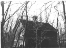
The English barn Looking SW Neg. file # 1-2 slide