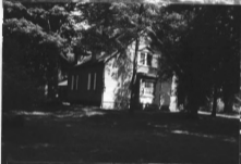
View looking SE showing section A neg. file # 6-6