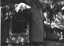
View looking N showing sections C,B,D neg file #6-8