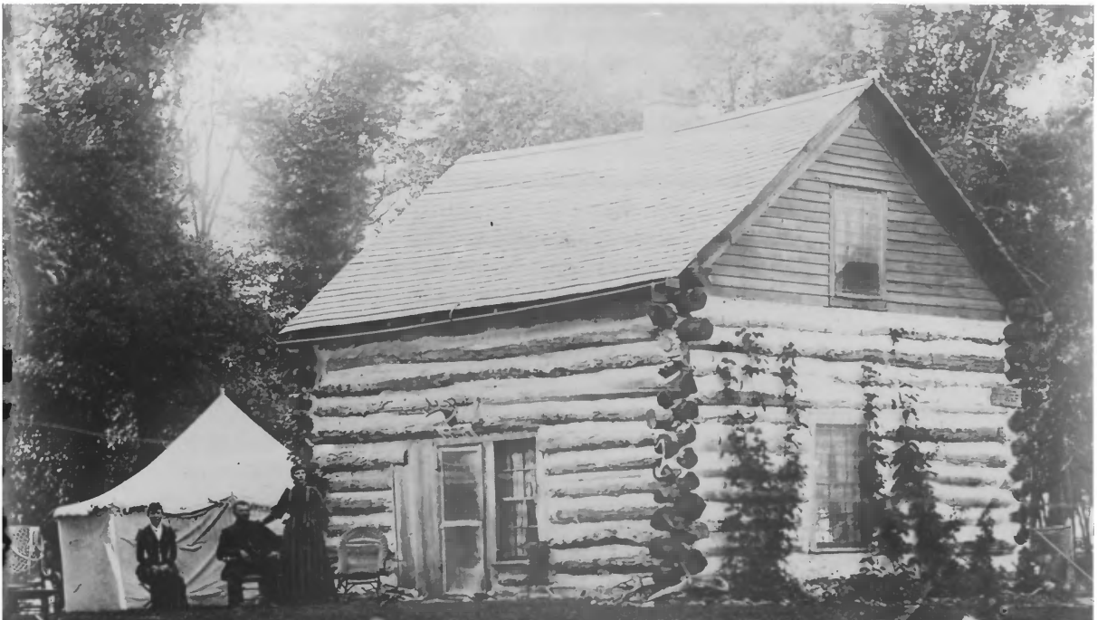
Famous Home at Okoboji Lake, Iowa, of the Gardner family who were victims of the massacre of 1857. All killed but one daughter who six months a captive with the Indians.