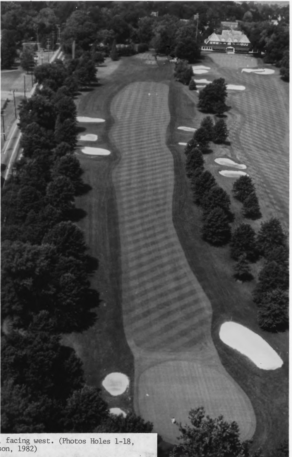
Hole 1, facing west.