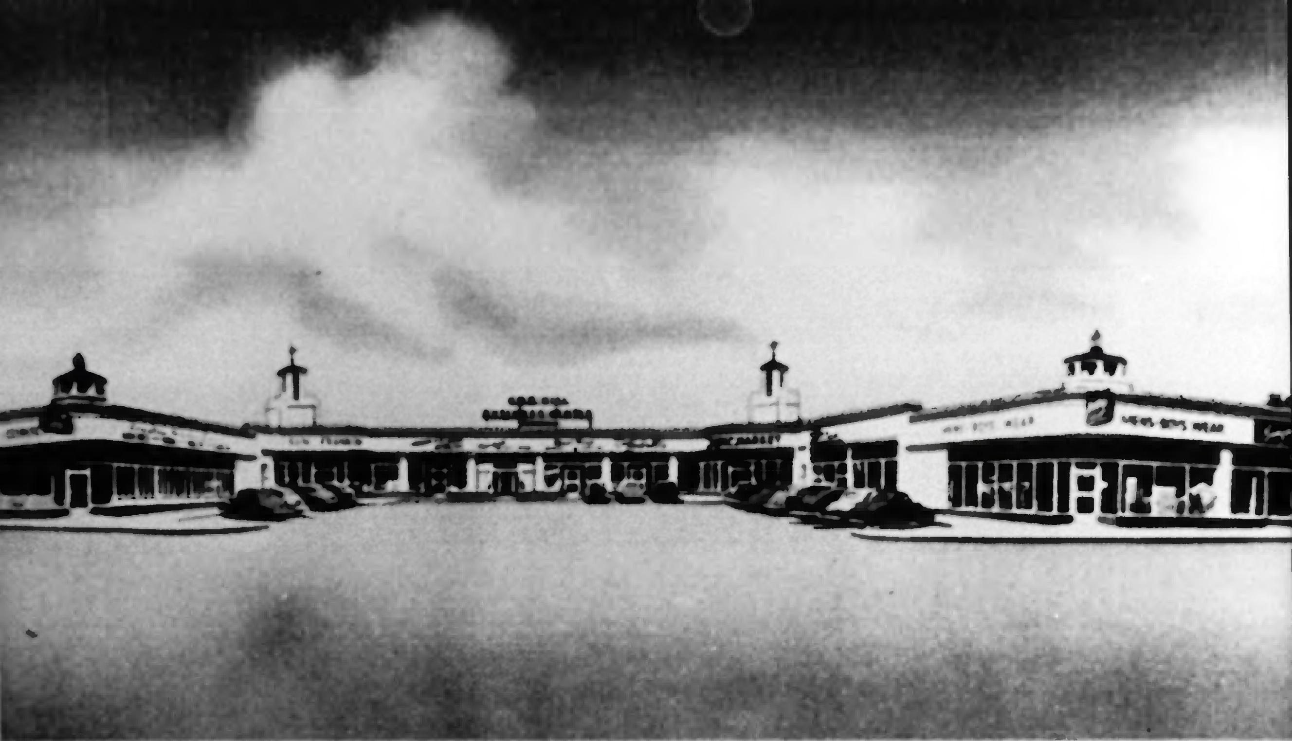
A-51—NOB HILL BUSINESS CENTER, 3500 EAST CENTRAL AVE., ALBUQUERQUE, N. M. NEWEST, MOST MODERN AND CONVENIENT SHOPPING CENTER