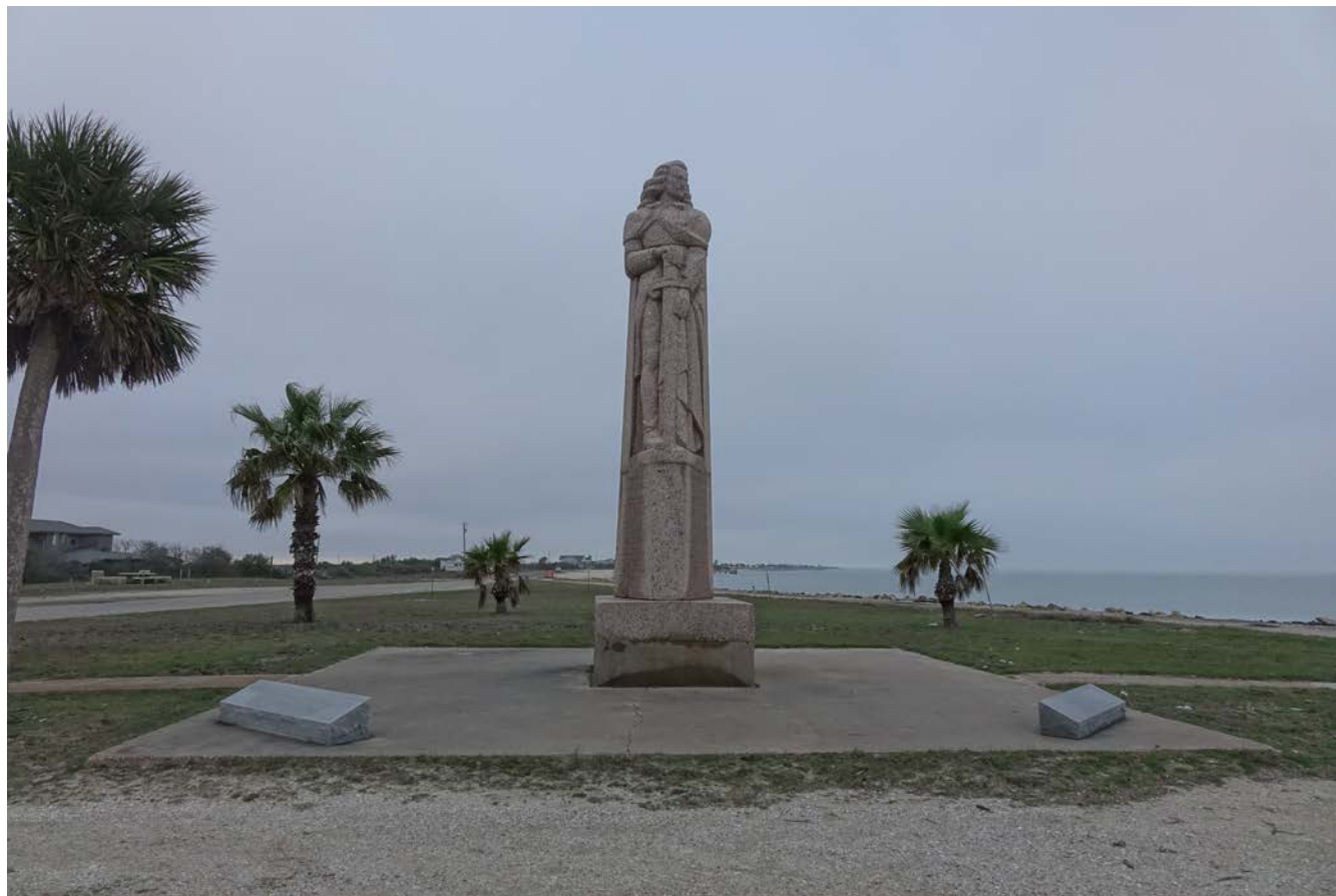
Photo 1: La Salle Monument southeast (front) elevation—camera faces northwest.

La Salle Monument Indianola, Calhoun County, Texas February 14, 2018