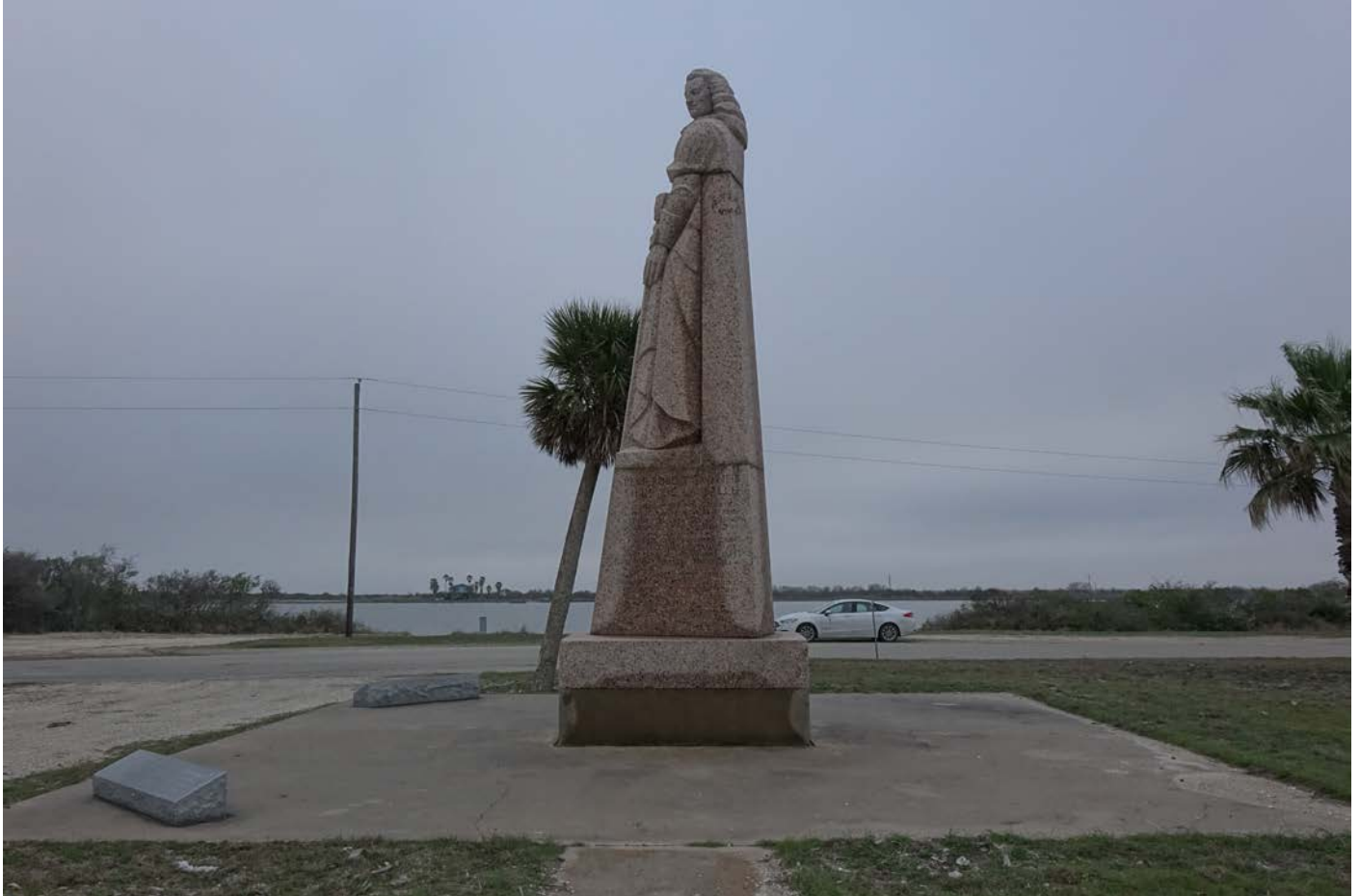
Photo 3: La Salle Monument, northeast elevation—camera faces southwest.