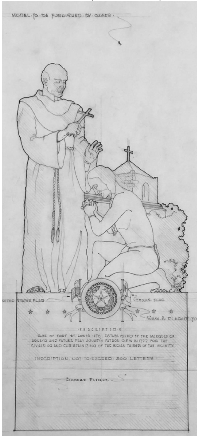
Figure 4: Rendering of Raoul Josset-designed bronze plaque for the original proposed granite slab monument commemorating Fort St. Louis and Presidio Nuestra Senora de Loreto de la Bahía, dated June 18, 1936. Source: Centennial Markers Collection, Records, Texas Historical Commission. Archives and Information Services Division, Texas State Library and Archives Commission.