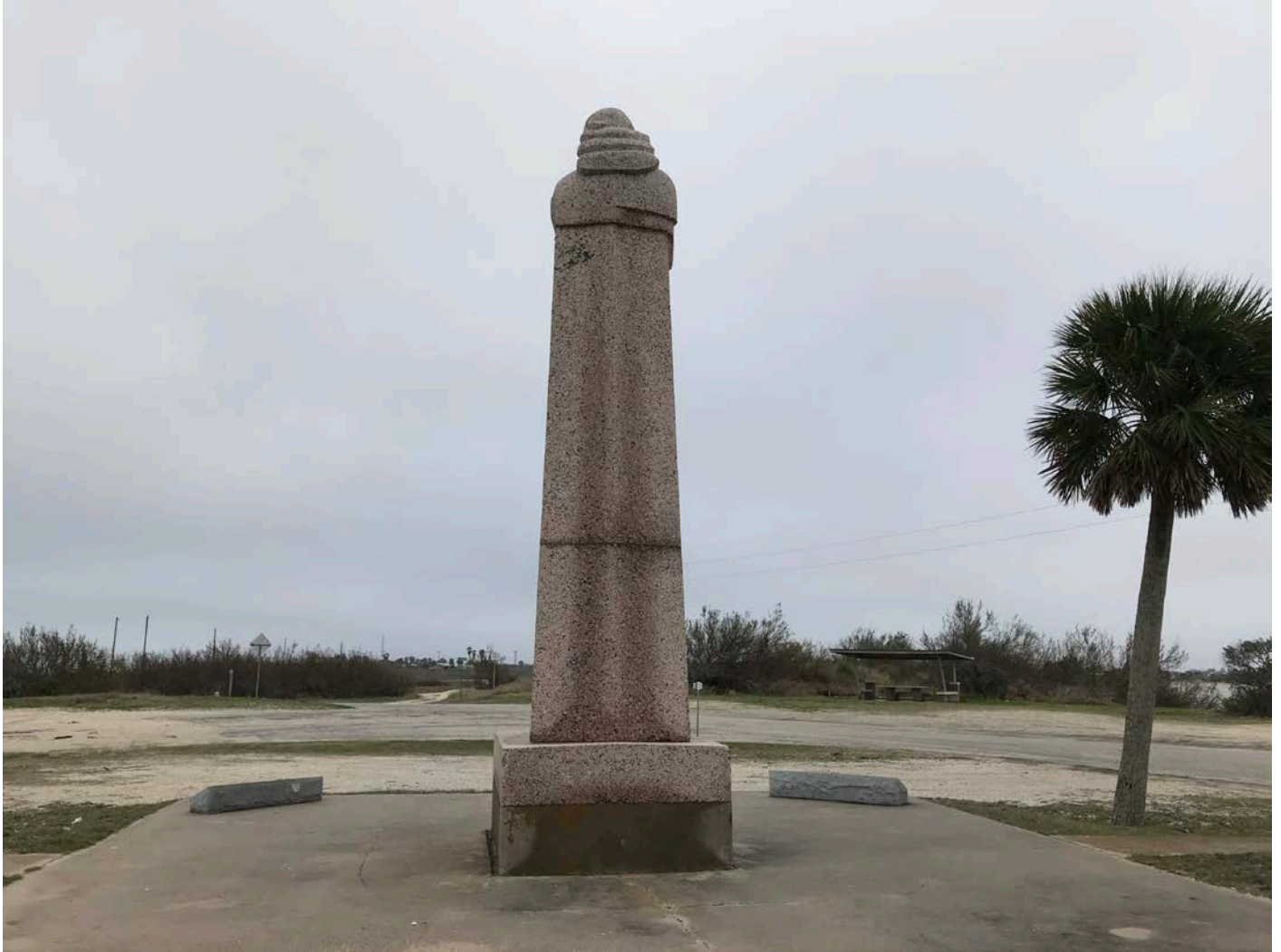
Photo 4: Rear (northwest) elevation of the La Salle Monument—camera faces southeast. The shaft is composed of four pieces, on which a combination of full-rounded and relief sculpture is carved.