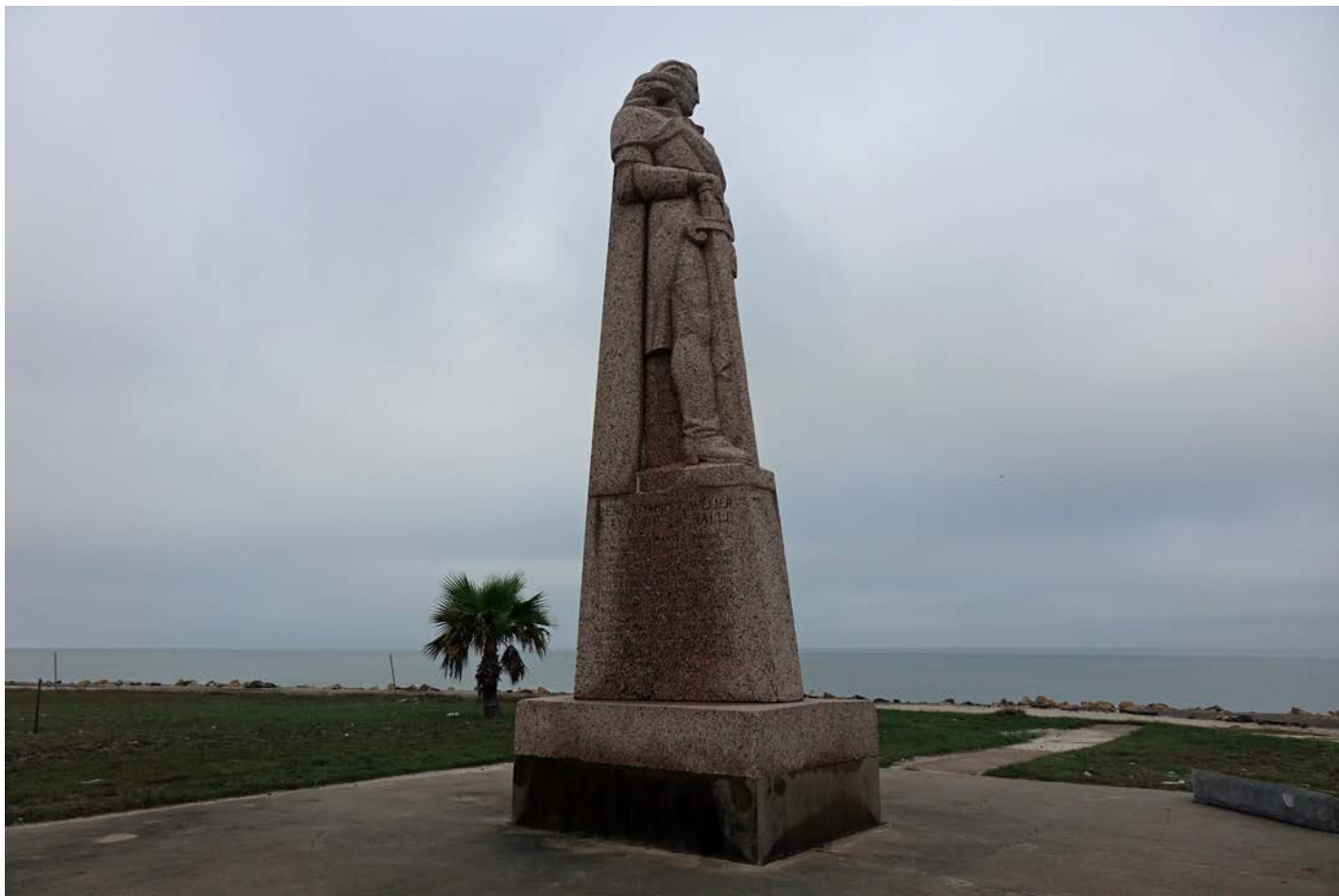
Photo 5: West oblique of the La Salle Monument—camera faces east. Josset depicted La Salle looking east towards Matagorda Bay and the Gulf of Mexico.