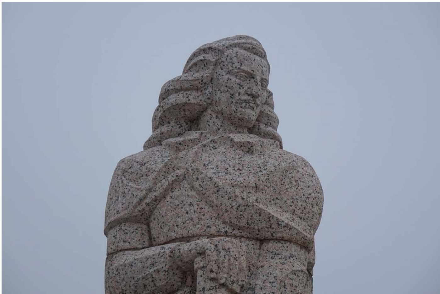
Photo 2: Detail of La Salle Monument—camera faces northwest. The upper portion of the La Salle monument is a full-rounded sculpture.