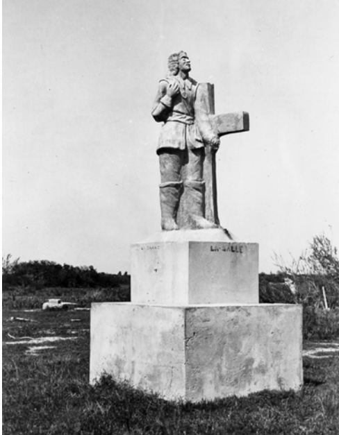
Figure 3: The remnants of Sweetwater's 1928 La Salle statue after a hurricane broke it in half. Someone decapitated and stole La Salle's head, which "was the best part of the work," Sweetwater once recalled.