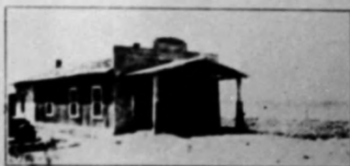
DEARFIELD LUNCH ROOM

Now that we have the best of accommodations here, the next thing is "Where shall we go for a little recreation and a good country lunch or dinner?"