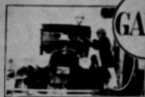
GAS, OIL and AIR TO SERVICE

If you care to fish or hunt in season, you will find this territory well adapted to these sports. If you care for a swim, there are many lakes and canals close at hand. If you are on your vacation you can find no better place to stop. FREE camp grounds, camp cottages for rent; and everything to make your outing enjoyable. Fine drives on every hand—through beautiful farming communities and the famous Eastern Colorado Oil Fields.