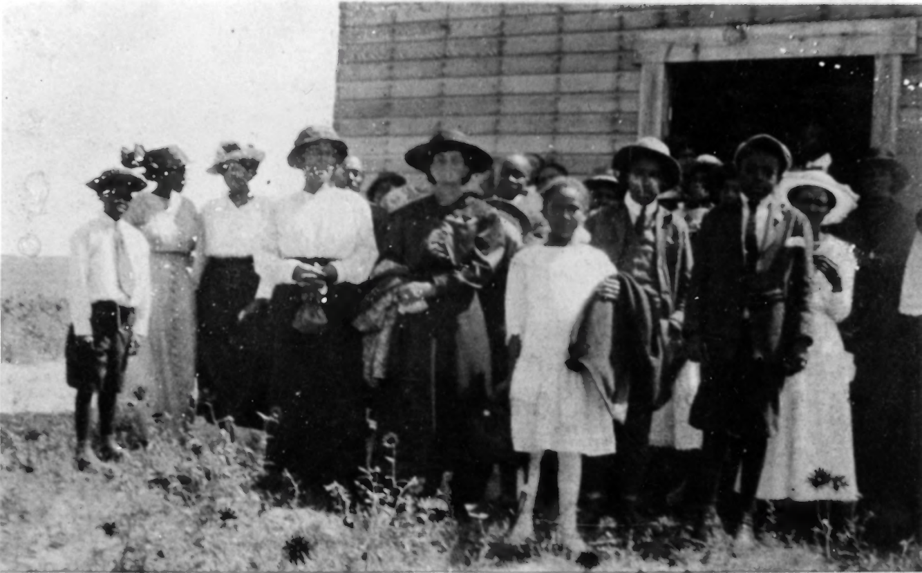
PERMANENT COLLECTION---CITY OF GREELEY MUSEUM