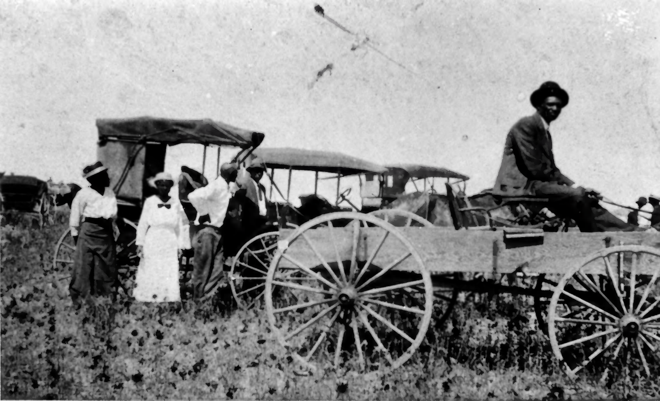
PERMANENT COLLECTION---CITY OF GREELEY MUSEUM