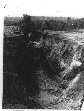
A GULLY THAT WAS TYPICAL OF THE 148-ACRE FARM BEFORE REBUILDING Several similar guilles out through the form back in 1818.