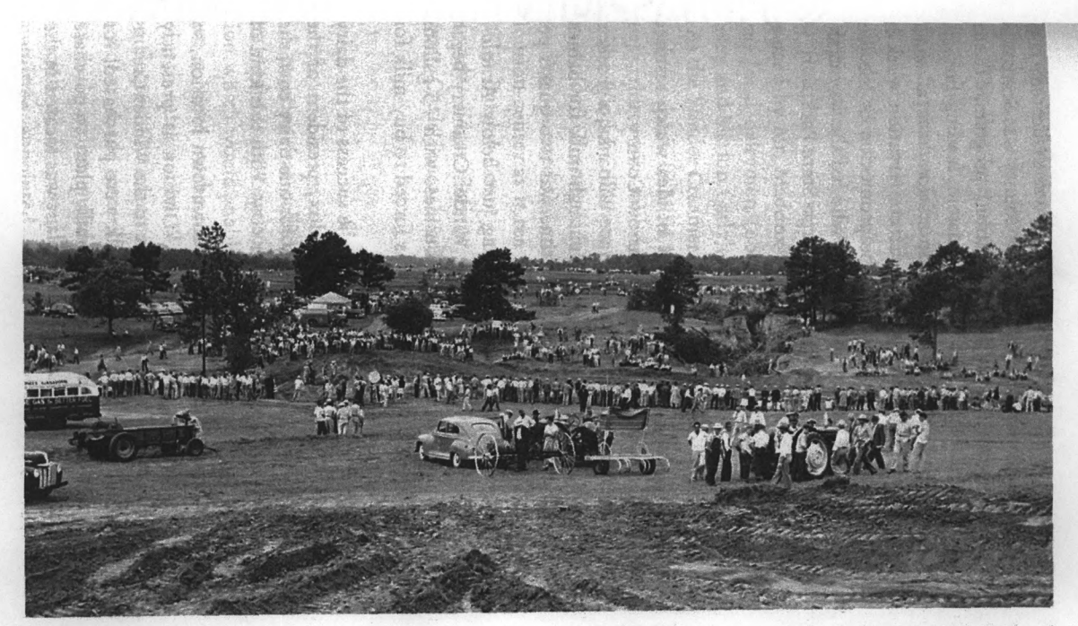
Hundreds of bystanders watch in amazement as men, machines and hard work effect a one-day transformation of a depleted Barrow County farm in 1948.