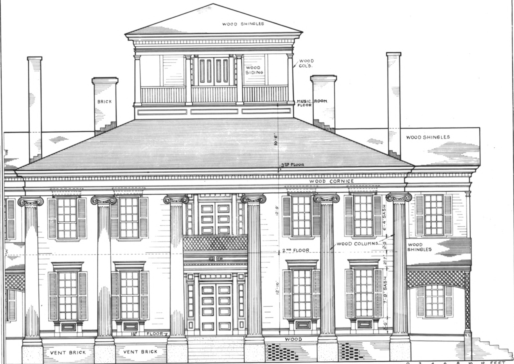
SOUTH ELEVATION SCALE - 1/4" = 1'-0"