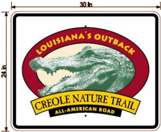
Official road sign used for route identification of the Creole Nature Trail.