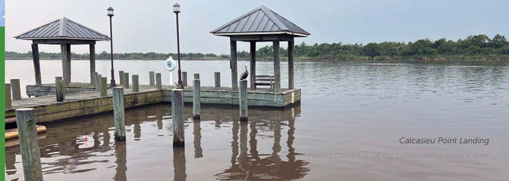
Calcasieu Point Landing

These community-led projects for long-term recovery seek to improve the quality of life in disaster-impacted areas. In advancing its mission in natural and cultural resource conservation and outdoor recreation, the National Park Service teams up with local partners to extend the benefits of the mission to special places close to home, in communities across Southwest Louisiana.