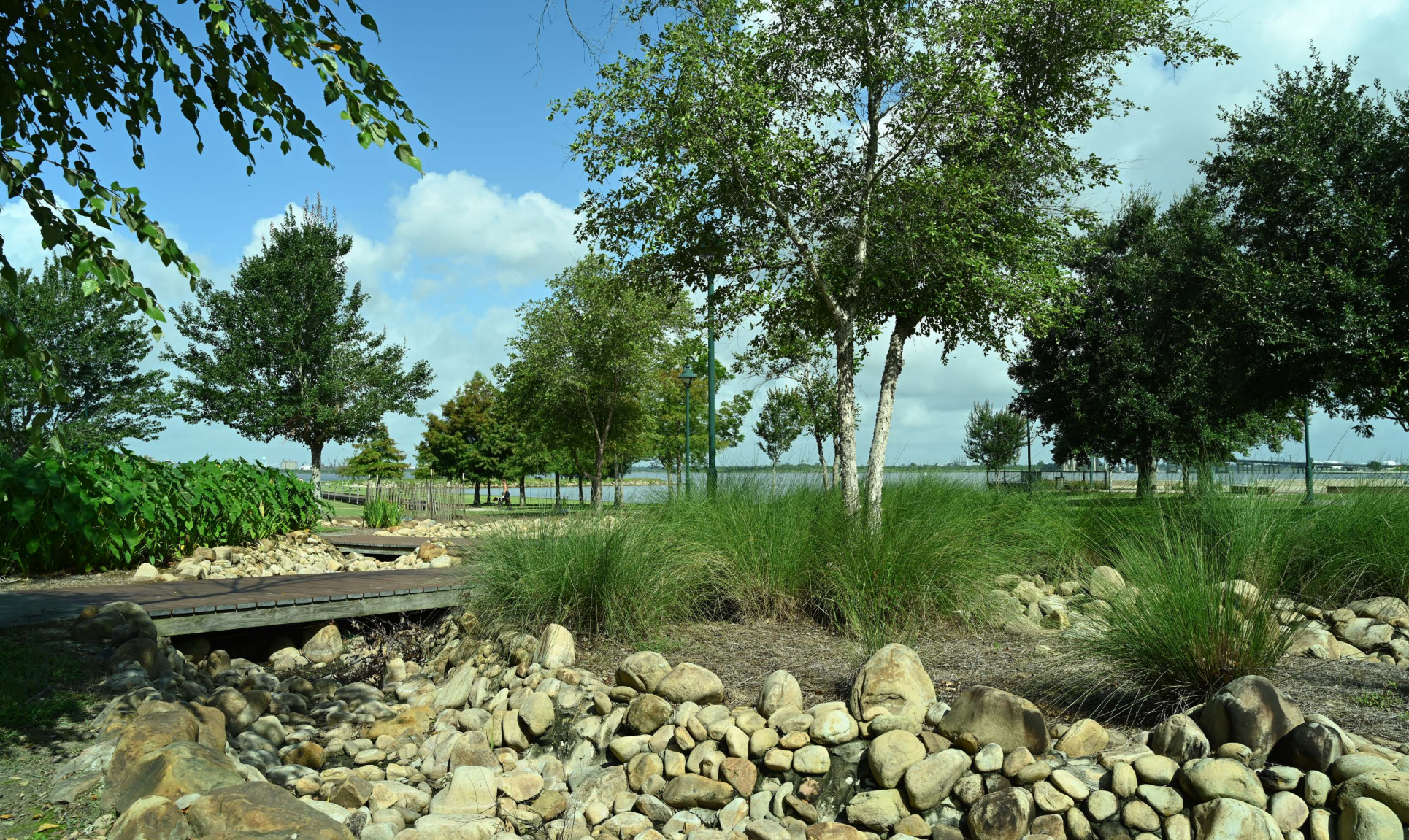
Prien Lake Park

Recognizing that long-term projects benefit from “low-hanging fruit” implementation, project partners identified signage as an opportunity for an early, impactful success. In 2011, the Creole Nature Trail partners developed and implemented a Signage Plan, but since then, many signs have been damaged or destroyed by subsequent storms. With funding from FEMA, NPS-RTCA was able to purchase 165 route identification signs to address this crucial need, and in 2024, local partners coordinated their installation with the Louisiana Department of Transportation and Development.