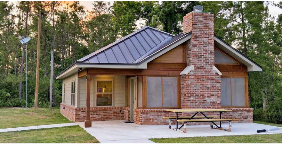
A new cabin at Sam Houston Jones State Park.