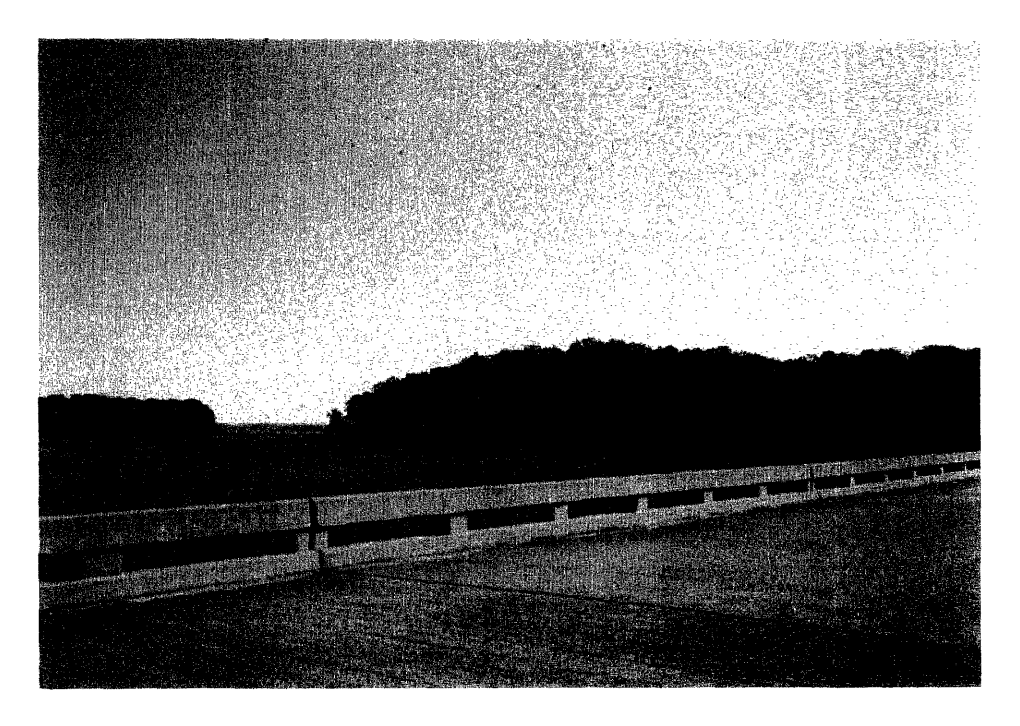
Contemporary view of 1980s bridge railing detail which replaced the historic railing seen above (1996). LANDSCAPES.