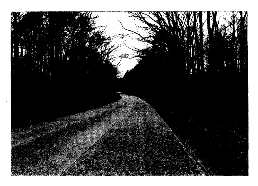
Contemporary view of Capital Landing Overpass (1996). LANDSCAPES.