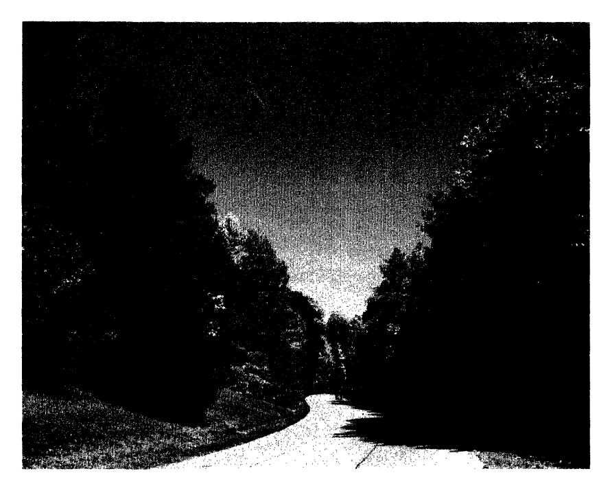
Historic view of vegetation with sky overhead (c.1970). National Park Service, Colonial National Historical Park.