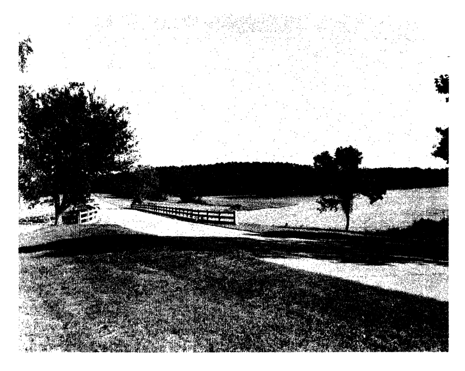
Historic view of Felgates Creek (c.1958). Note trees at bridge abutments. National Park Service, Colonial National Historical Park.