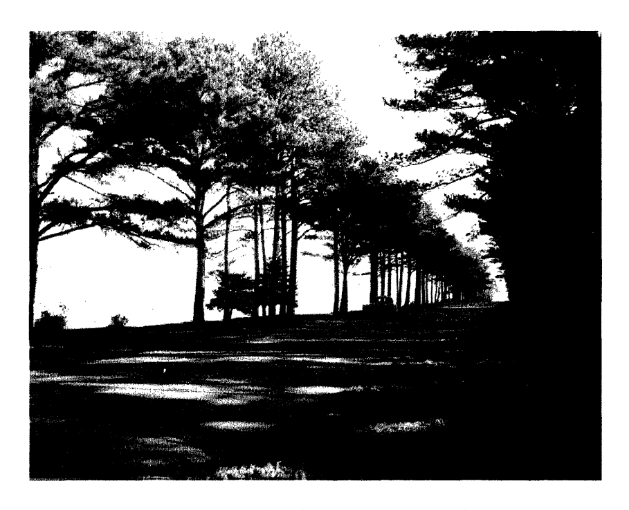
Historic view of Bellfield Straight (c.1958).