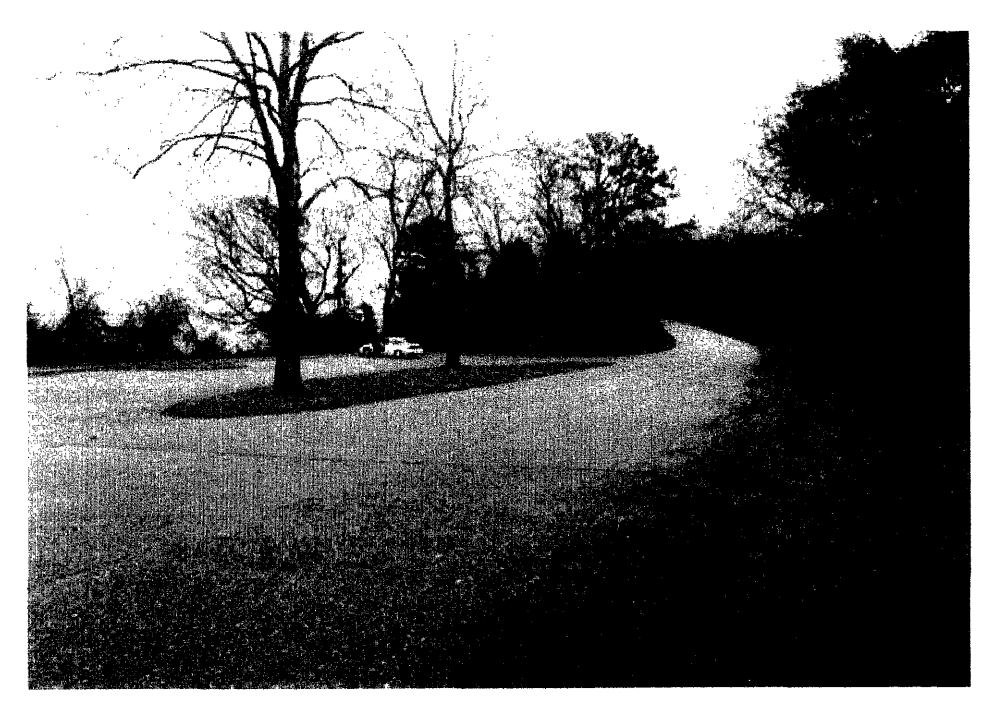
Contemporary view of overlook near Brackens Pond (1996). LANDSCAPES.