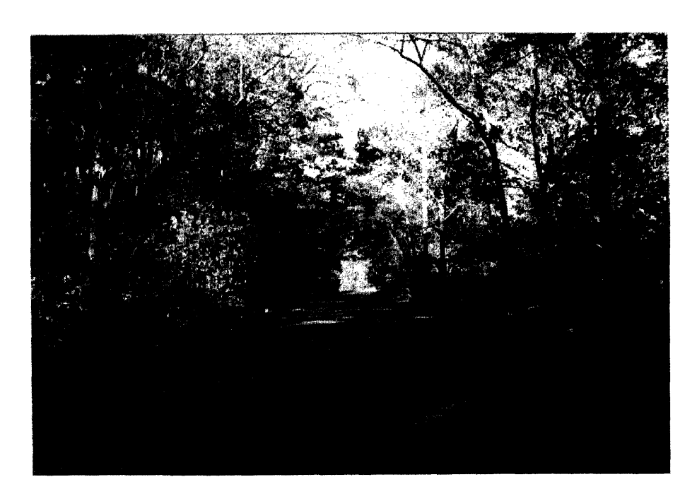
Contemporary view of vegetation enclosing the parkway (1996). LANDSCAPES.