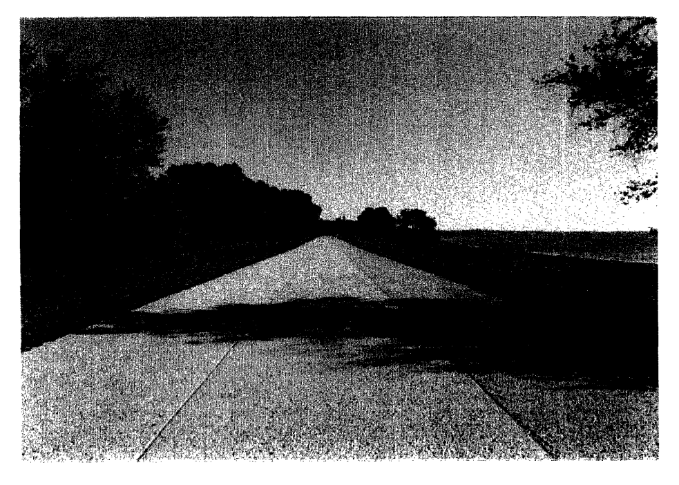
Contemporary view of Archers Hope (1996). LANDSCAPES.