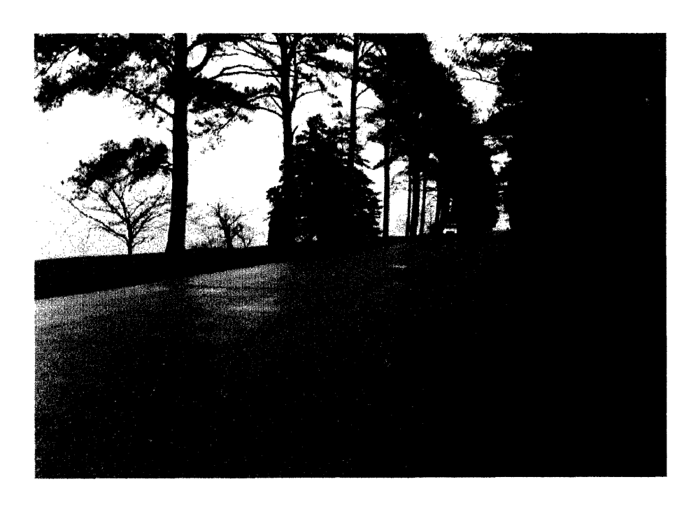
Contemporary view of Bellfield Straight (1996). LANDSCAPES.