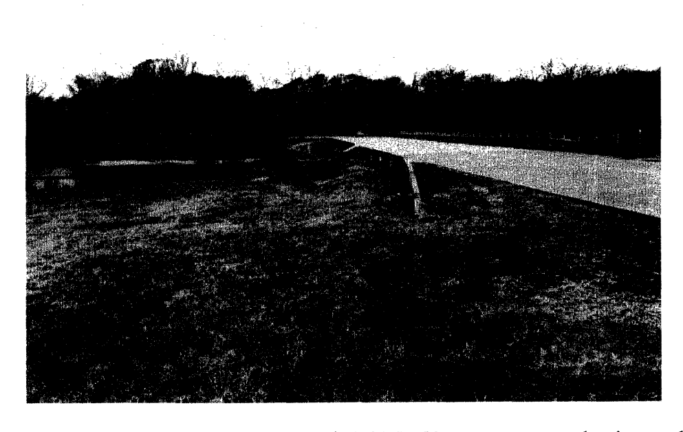
Contemporary view of Felgates Creek (1996). Note no trees or plantings at bridge abutments. LANDSCAPES.