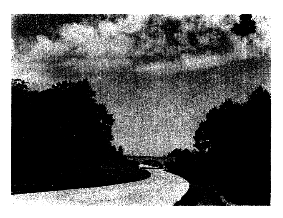
Historic view of Capital Landing Overpass (c.1938). National Park Service, Colonial National Historical Park.