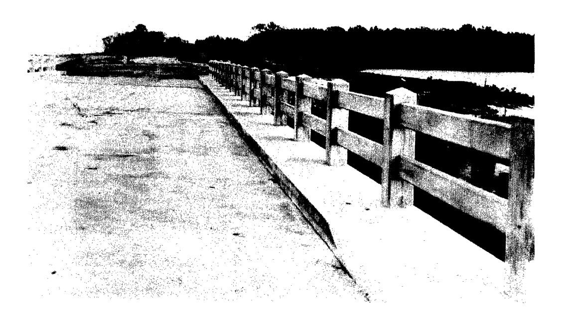
Historic view of bridge railing detail (c.1938).