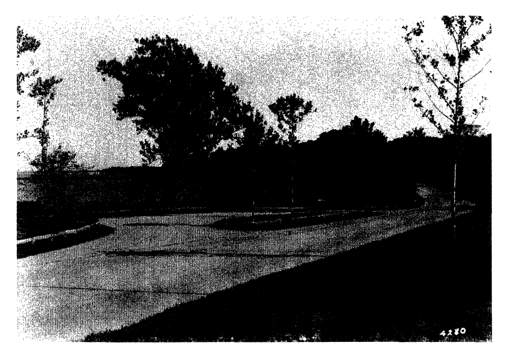
Historic view of overlook near Brackens Pond (c.1935). National Park Service, Colonial National Historical Park.