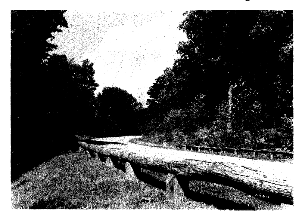
Historic view of 1930s peeled-log guard rail (c.1938).