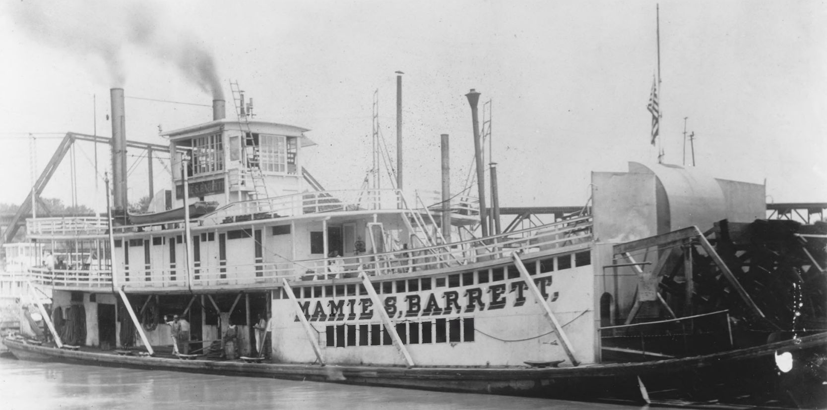
Howard Ship Yards & Dock Co., Mse. Manuscripts Department, Lilly Library Indiana University, Bloomington, Indiana