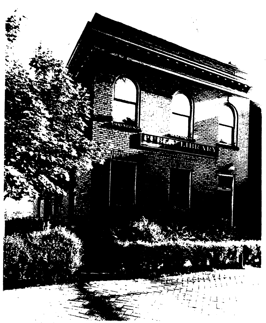
Fig. 2 This photo shows the building at 72 Greene Street (Resource No. 41) during the time that it was the home of the Cumberland Public Library. It was originally built as the pump house for the city water works which was located at the rear of the building along Wills Creek. The library occupied this property from 1824 until 1934, when it moved onto Washington Street into the building formerly occupied by the Cumberland Academy.