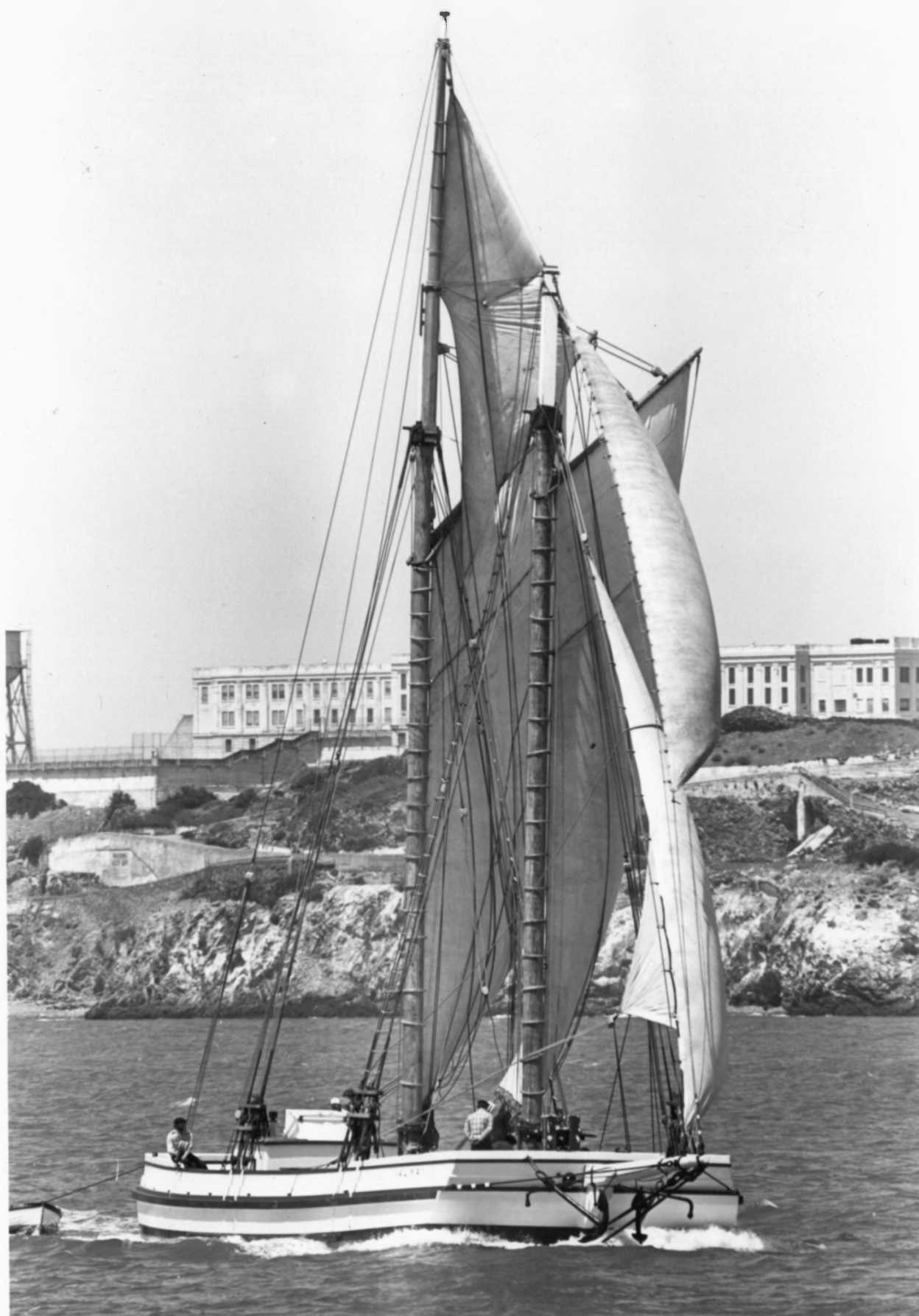
Golden Gate NRA - U.S. Department of the Interior, National Park Service - Photo by Richard Frear