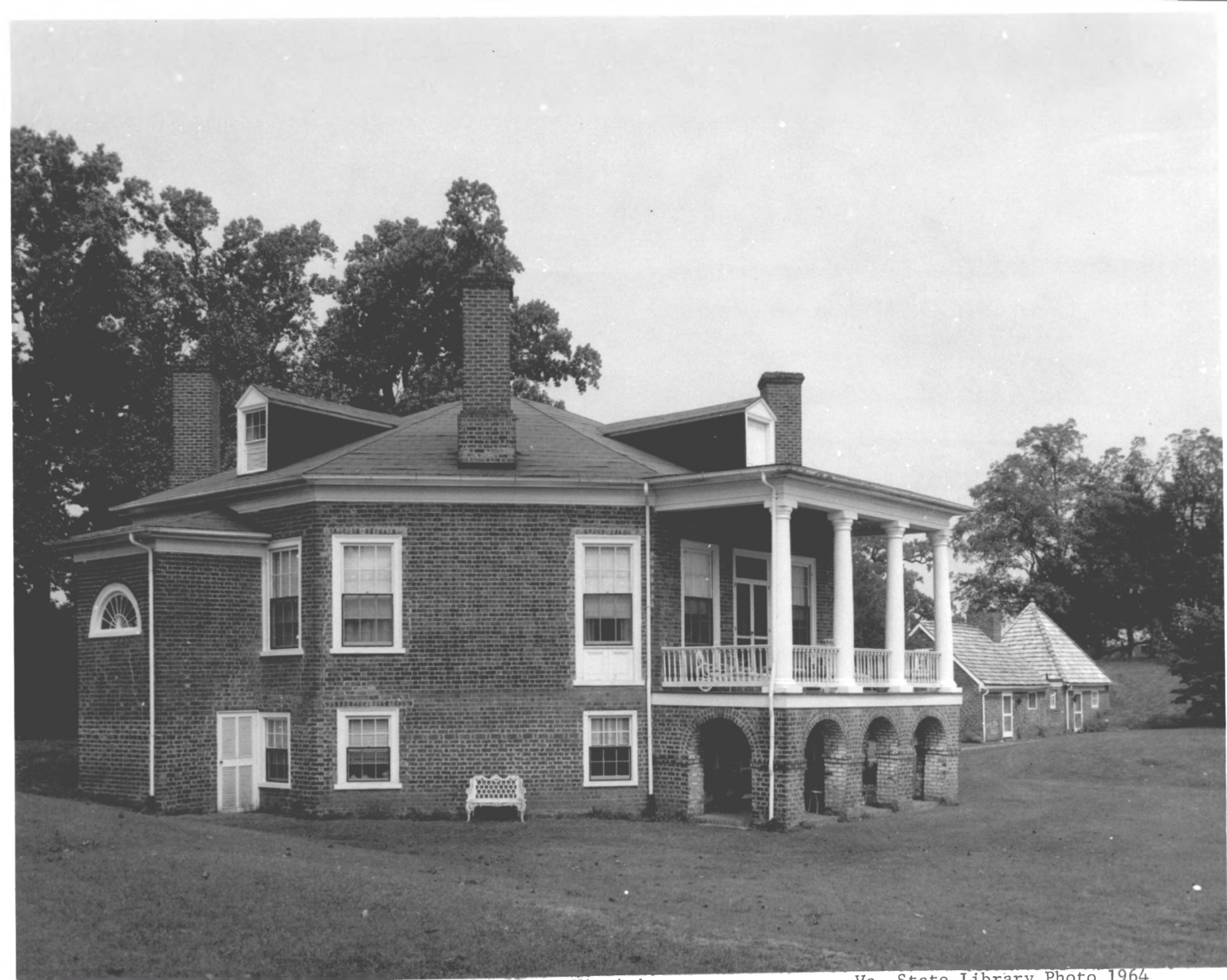
Popular Forest, Bedford County, Virginia