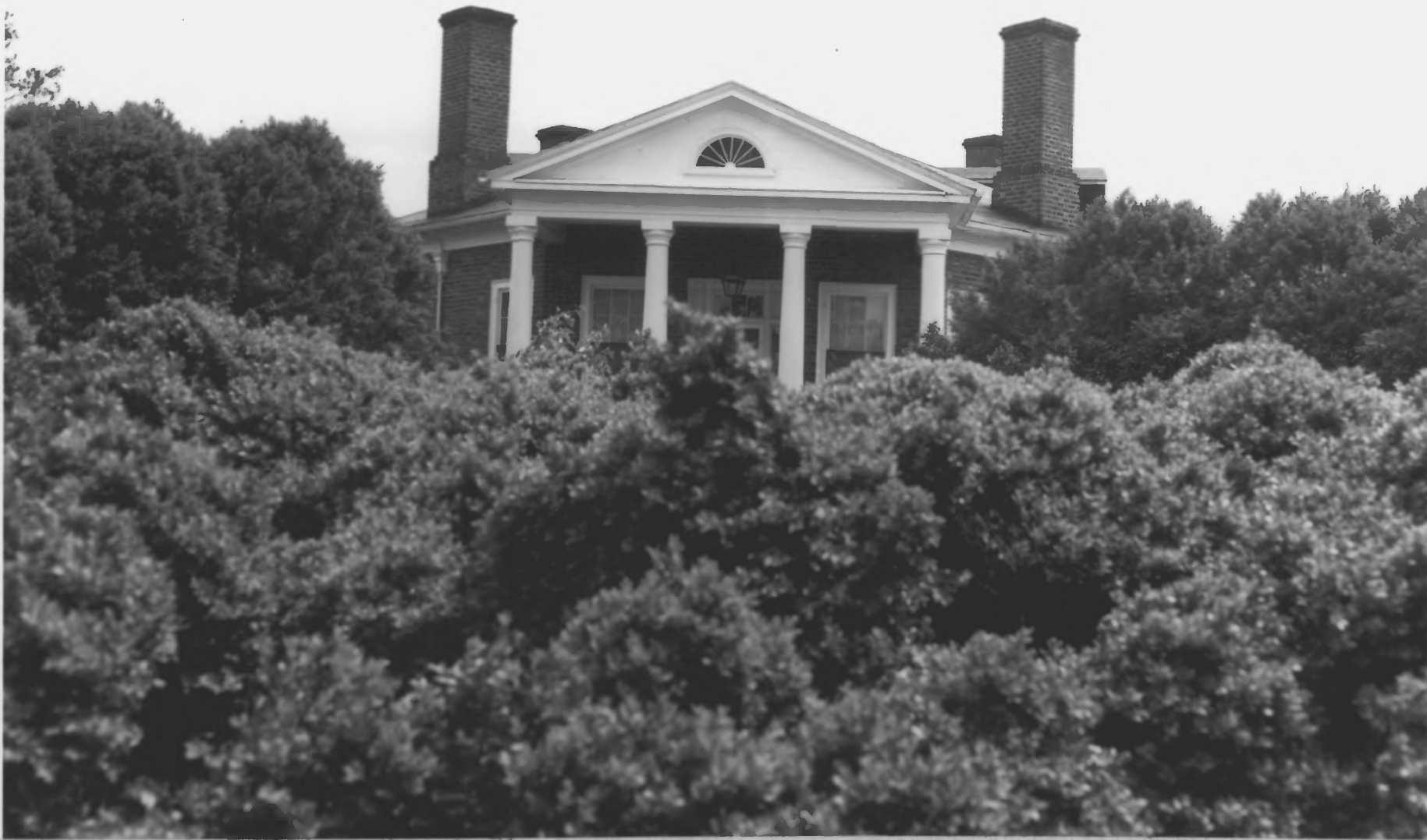
Poplar Forest, Forest, Virginia