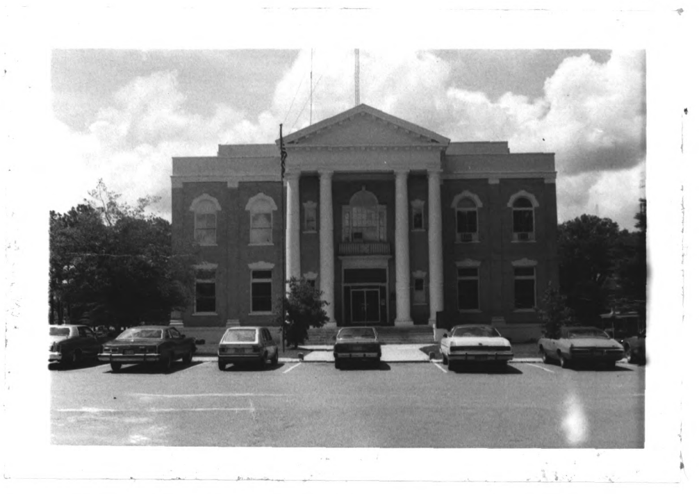
DODGE COUNTY COURTHOUSE

The site of the courthouse in its park-like square and the massiveness of the building make it an architectural focal point for the city of Eastman.