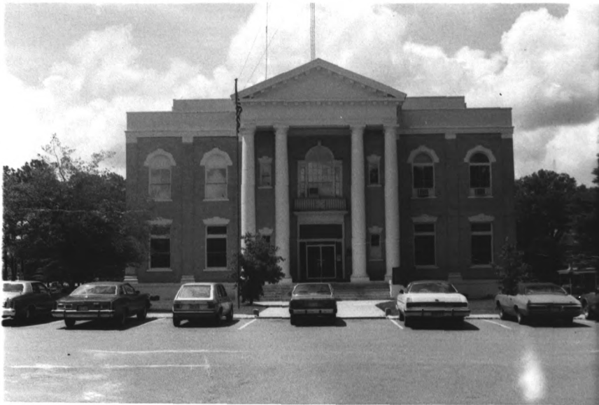
DODGE COUNTY COURTHOUSE