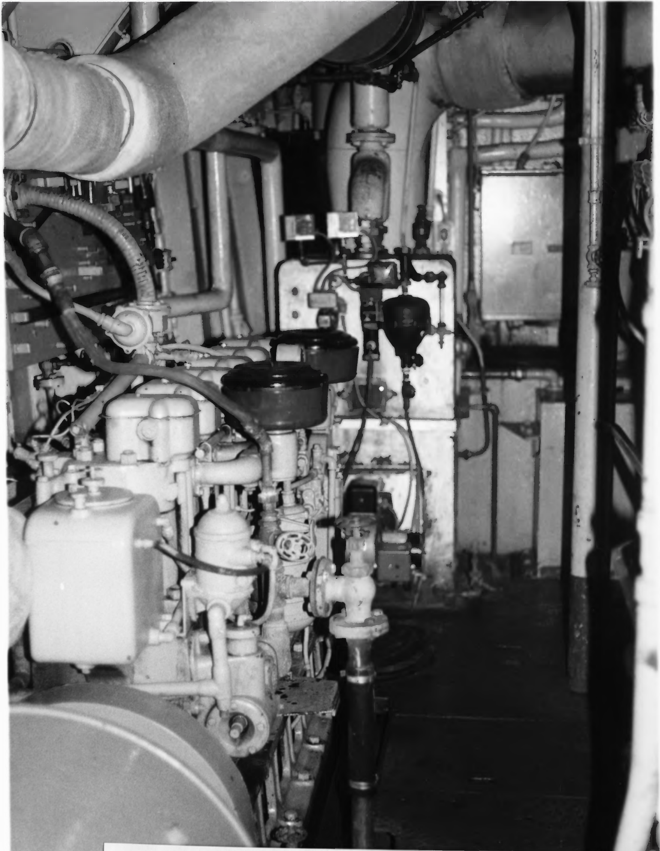
FIREBOAT CITY OF OAKLAND, EX-HOGA OAKLAND, CALIFORNIA Owner: UNITED STATES NAVY ENGINEROOM, SHOWING ORIGINAL 1940 PUMPS AND EQUIPMENT. Photo #11 by JAMES P. DELGADO, 1988 Courtesy of: NATIONAL PARK SERVICE