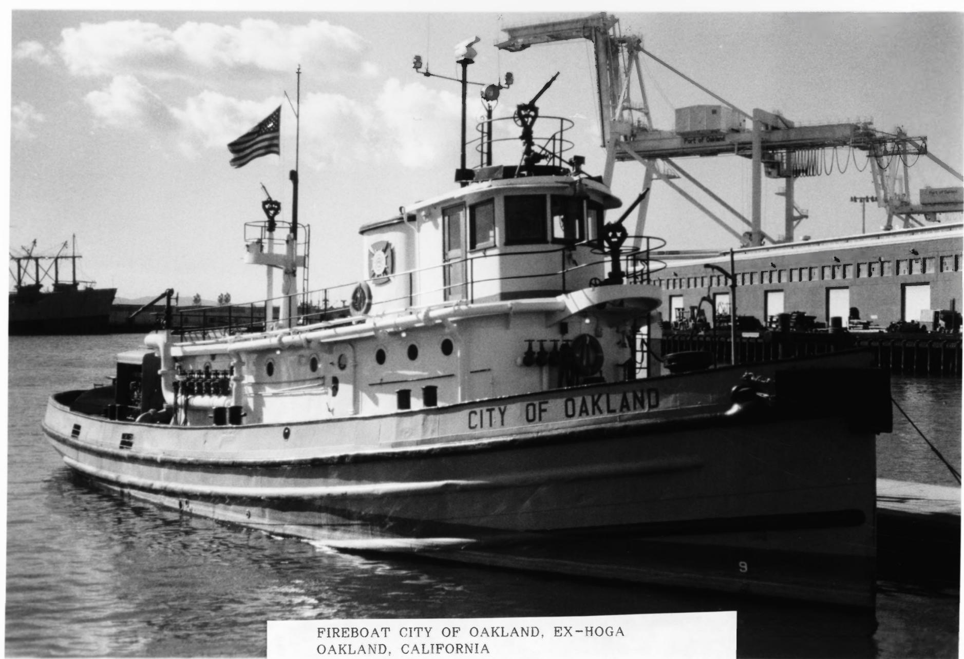
FIREBOAT CITY OF OAKLAND, EX-HOGA OAKLAND, CALIFORNIA Owner: UNITED STATES NAVY STARBOARD BOW VIEW OF CITY OF OAKLAND. Photo #3 by JAMES P. DELGADO, 1988 Courtesy of: NATIONAL PARK SERVICE