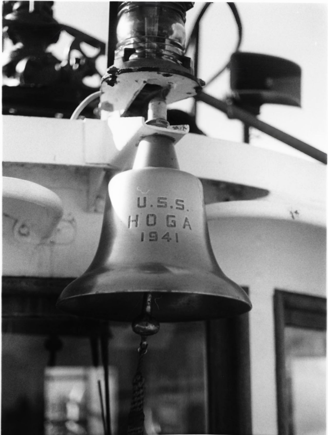
FIREBOAT CITY OF OAKLAND, EX-HOGA OAKLAND, CALIFORNIA Owner: UNITED STATES NAVY SHIP'S BELL, ADDED IN RECENT YEARS. Photo #7 by JAMES P. DELGADO, 1988 Courtesy of: NATIONAL PARK SERVICE