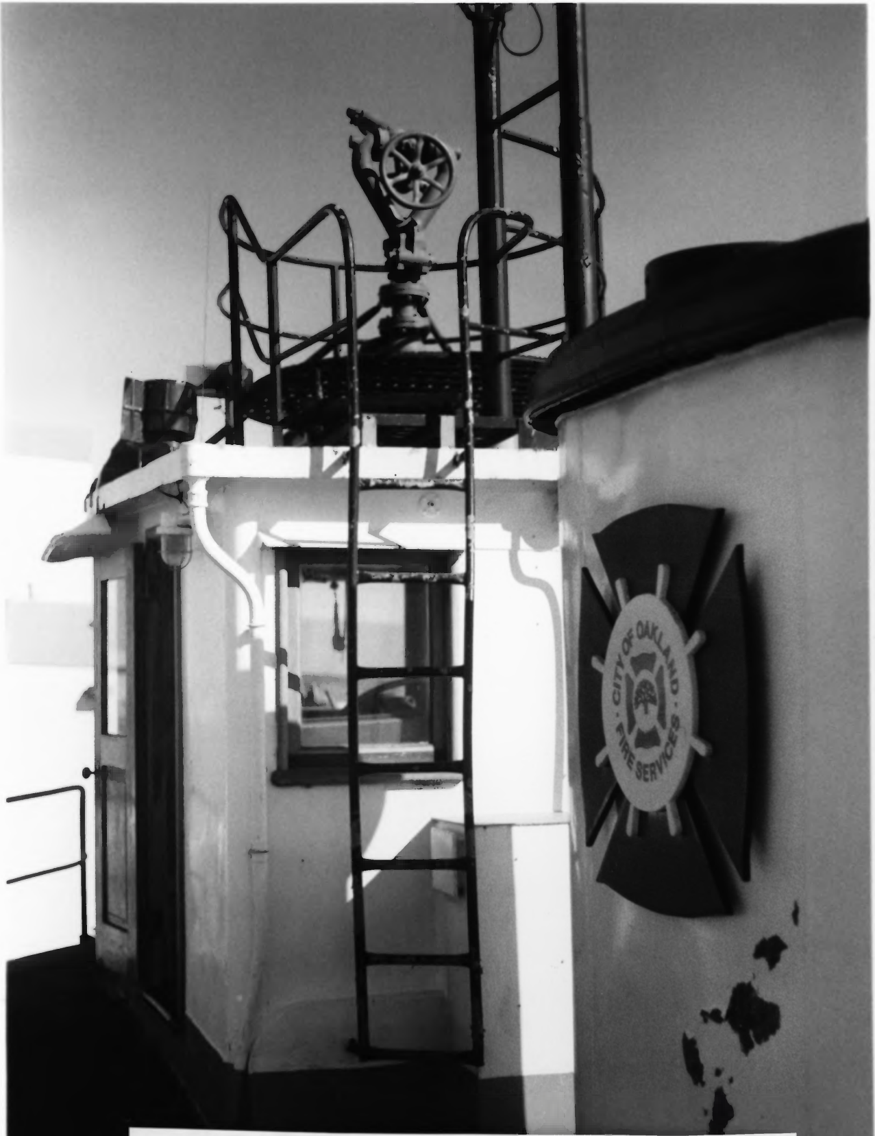
FIREBOAT CITY OF OAKLAND, EX-HOGA OAKLAND, CALIFORNIA Owner: UNITED STATES NAVY BOAT DECK, SHOWING PILOTHOUSE, STACK, AND ORIGINAL PILOTHOUSE MONITOR. Photo #5 by JAMES P. DELGADO, 1988 Courtesy of: NATIONAL PARK SERVICE