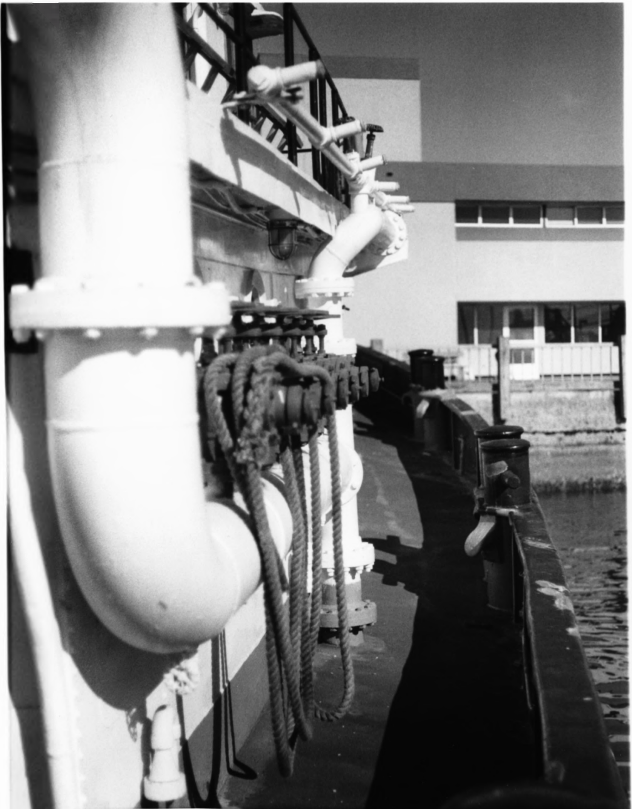
FIREBOAT CITY OF OAKLAND, EX-HOGA OAKLAND, CALIFORNIA Owner: UNITED STATES NAVY VIEW FORWARD, STARBOARD BEAM, SHOWING MANIFOLD AND FIRE HOSE CONNECTIONS. Photo #4 by JAMES P. DELGADO, 1988 Courtesy of: NATIONAL PARK SERVICE