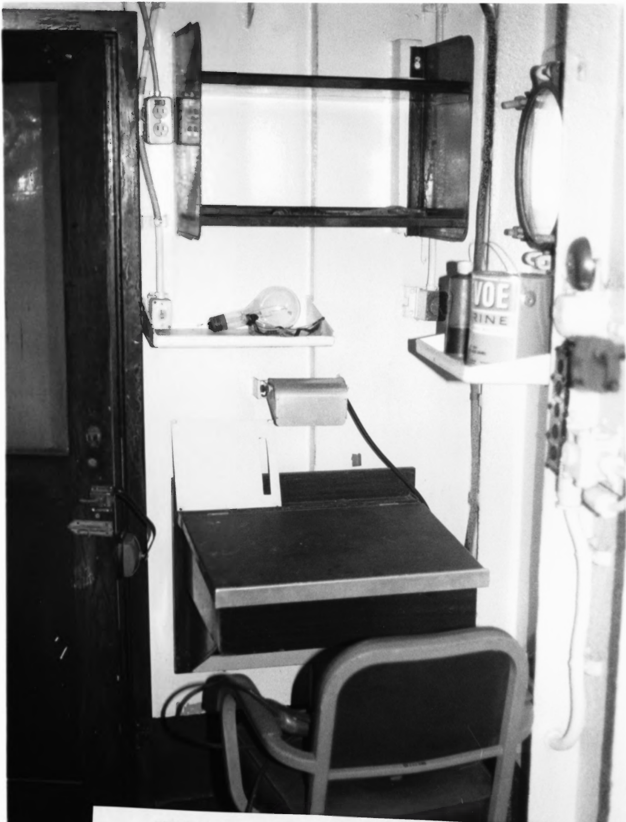
FIREBOAT CITY OF OAKLAND, EX-HOGA OAKLAND, CALIFORNIA Owner: UNITED STATES NAVY TUGMASTER'S CABIN, SHOWING ORIGINAL U.S. NAVY ISSUE FURNISHINGS. Photo #10 by JAMES P. DELGADO, 1988 Courtesy of: NATIONAL PARK SERVICE