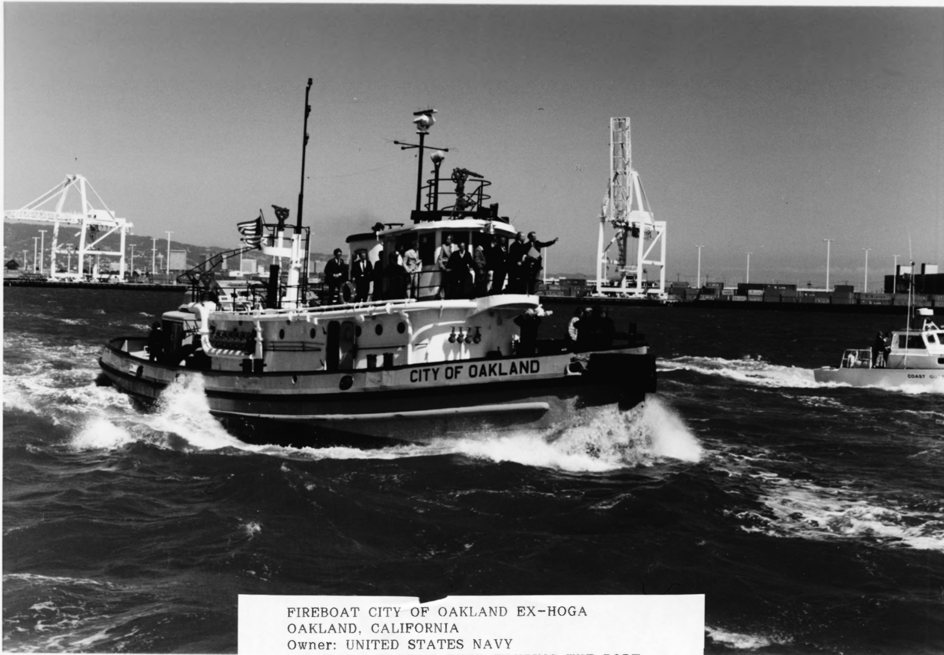
FIREBOAT CITY OF OAKLAND EX-HOGA OAKLAND, CALIFORNIA Owner: UNITED STATES NAVY PRESIDENT JIMMY CARTER TOURING THE PORT OF OAKLAND ABOARD THE FIREBOAT. Photo #2 by NORM FISHER, 1980 Courtesy of: PORT OF OAKLAND