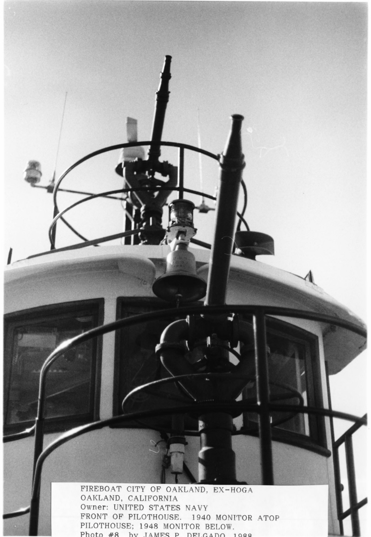
FIREBOAT CITY OF OAKLAND, EX-HOGA OAKLAND, CALIFORNIA Owner: UNITED STATES NAVY FRONT OF PILOTHOUSE. 1940 MONITOR ATOP PILOTHOUSE; 1948 MONITOR BELOW. Photo #8 by JAMES P. DELGADO, 1988 Courtesy of: NATIONAL PARK SERVICE