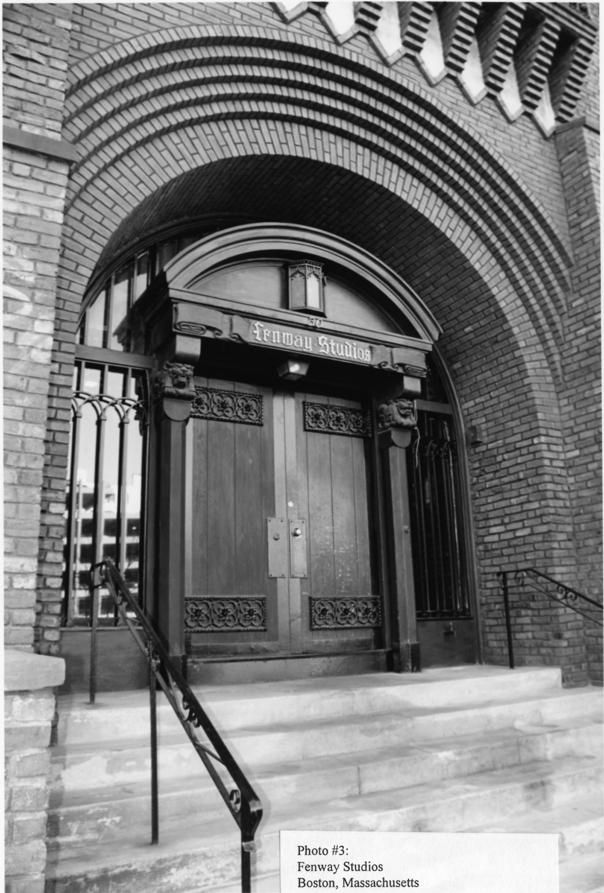
Photo #3: Fenway Studios Boston, Massachusetts Entranceway, north elevation Photo: Joyce Gardner Zvorskas, 1994