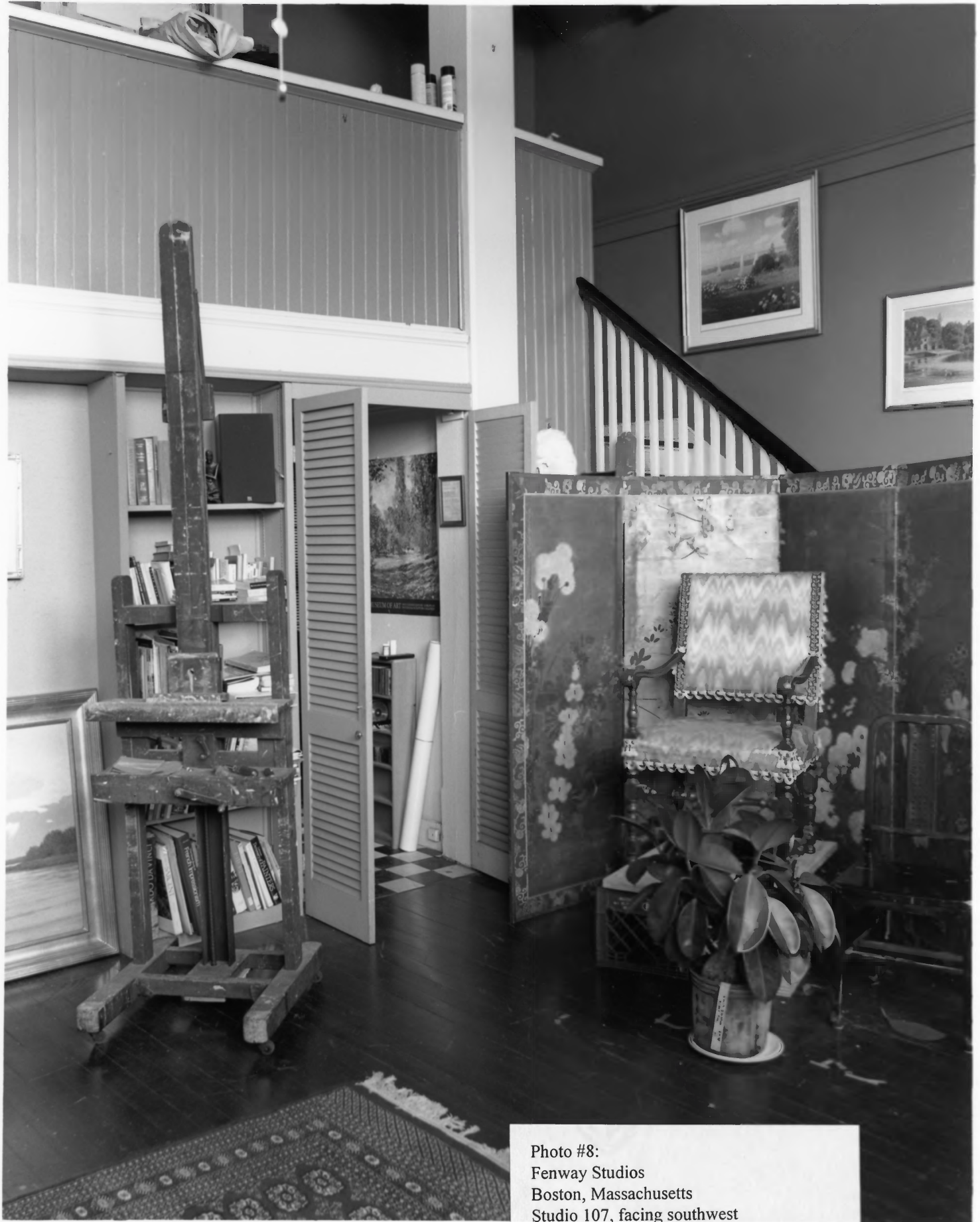
Photo #8: Fenway Studios Boston, Massachusetts Studio 107, facing southwest Photo: Gordon G. Bensley, 1997