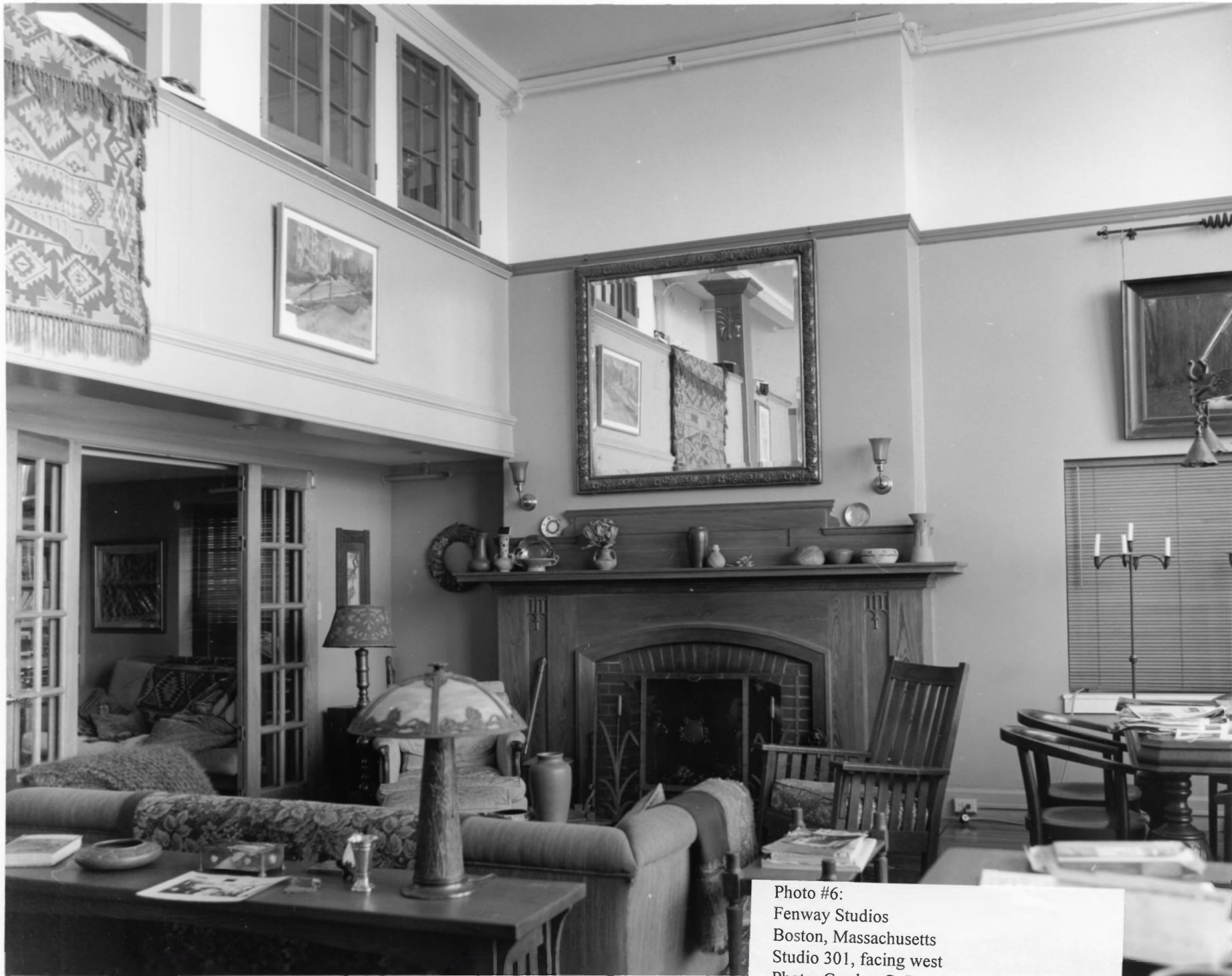
Photo #6: Fenway Studios Boston, Massachusetts Studio 301, facing west