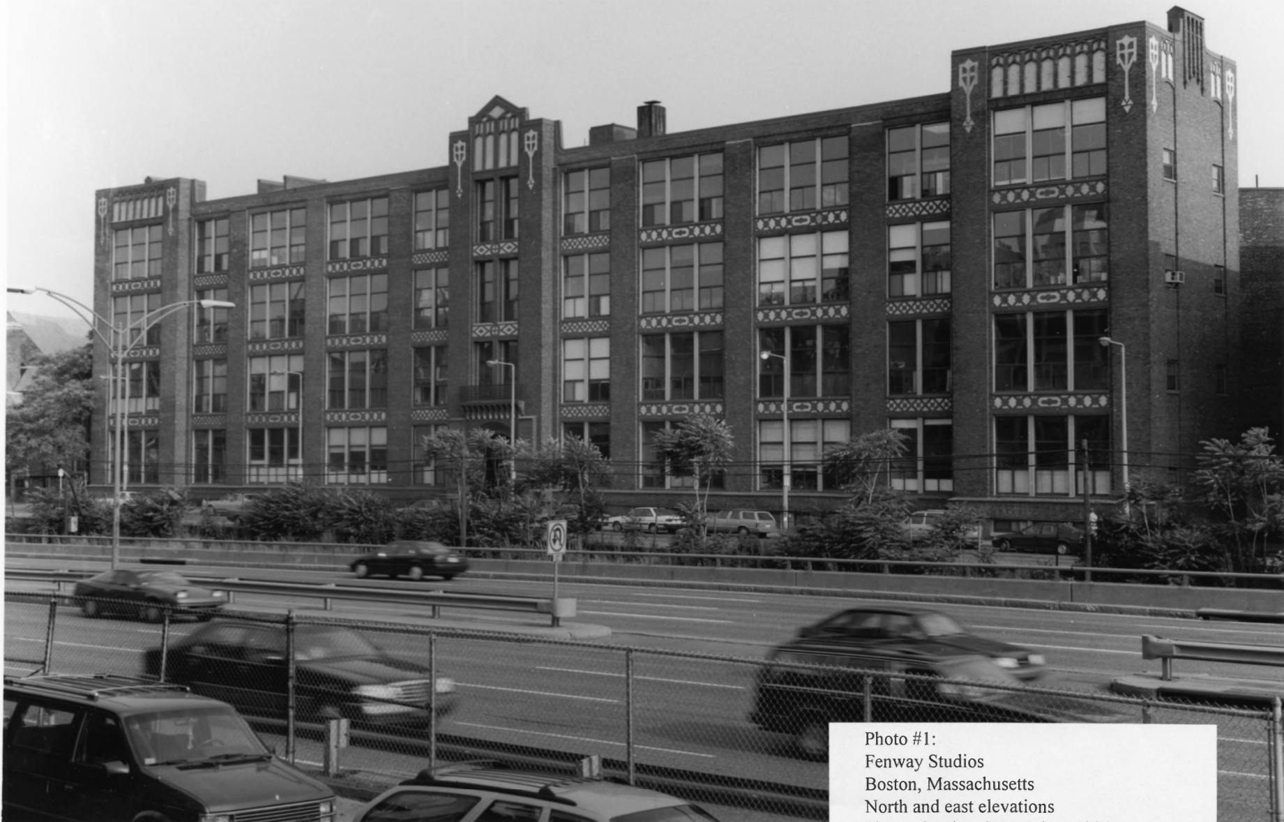
Photo #1: Fenway Studios Boston, Massachusetts North and east elevations Photo: Gordon G. Bensley, 1994