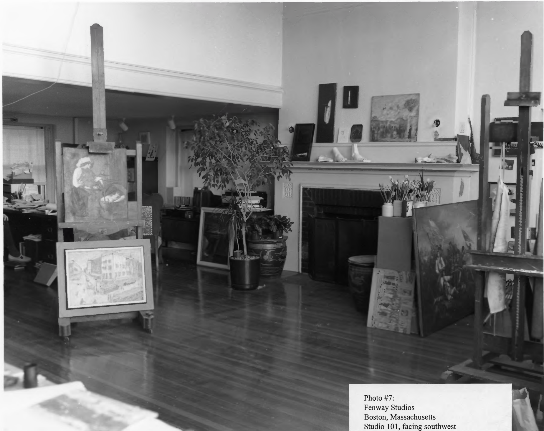
Photo #7: Fenway Studios Boston, Massachusetts Studio 101, facing southwest Photo: Gordon G. Bensley, 1997