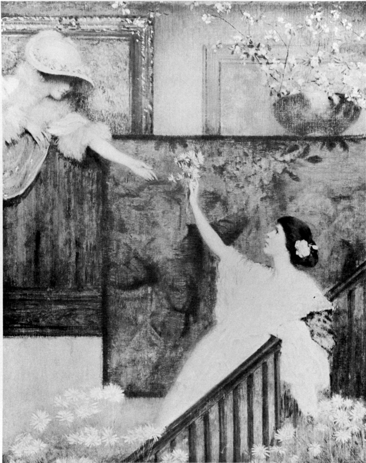
26. FENWAY STUDIO 25 x 20¼ oil Pennsylvania Academy of the Fine Arts, 117th Annual Exhibition, 1922