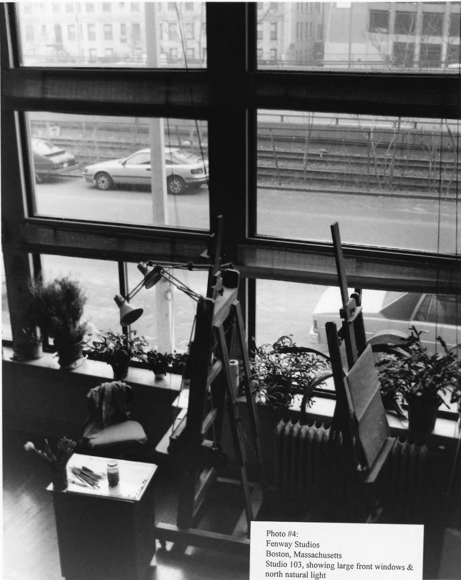
Photo #4: Fenway Studios Boston, Massachusetts Studio 103, showing large front windows & north natural light Photo: Teri Malo, 1998