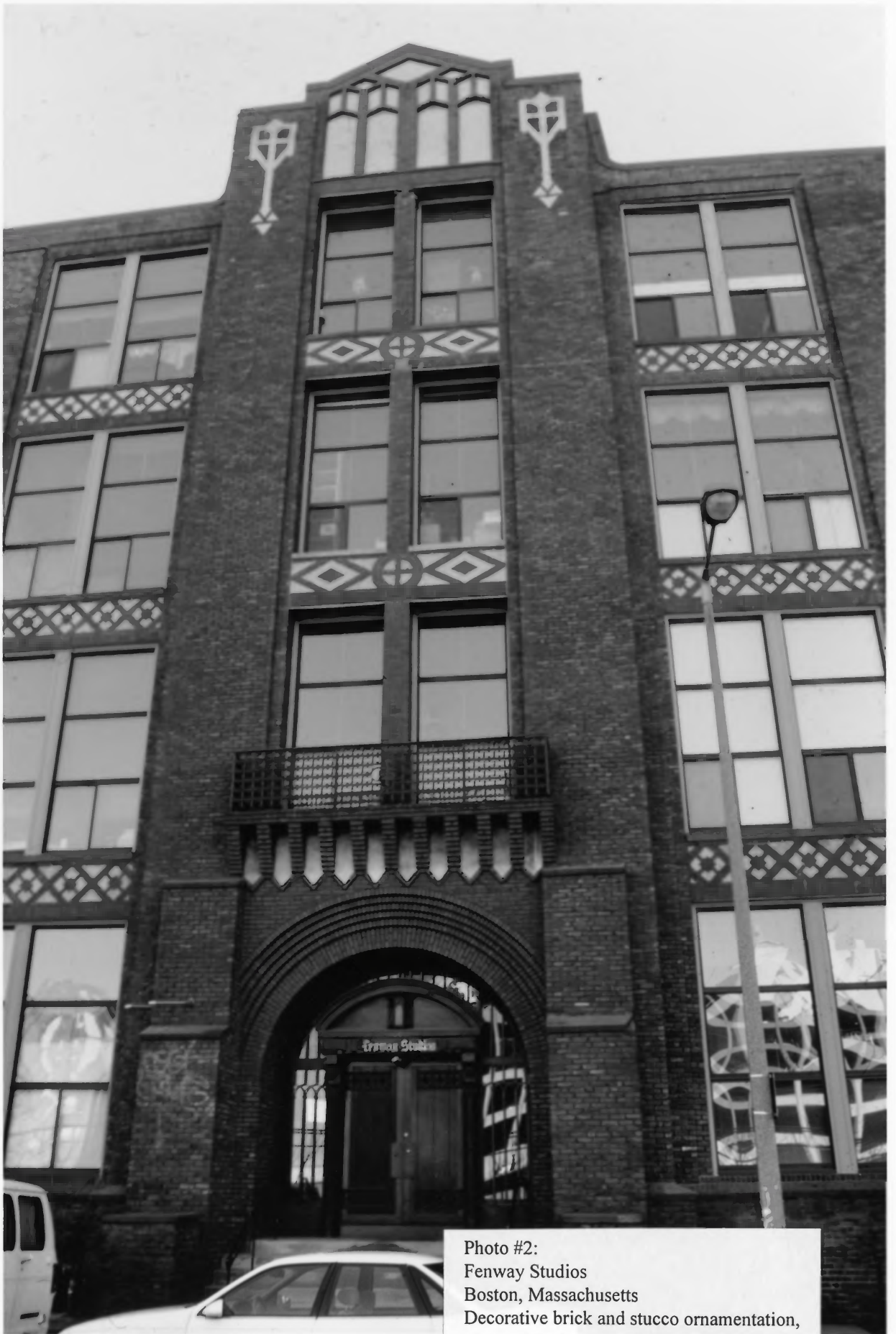
Photo #2: Fenway Studios Boston, Massachusetts Decorative brick and stucco ornamentation, North elevation Photo: Teri Malo, 1998