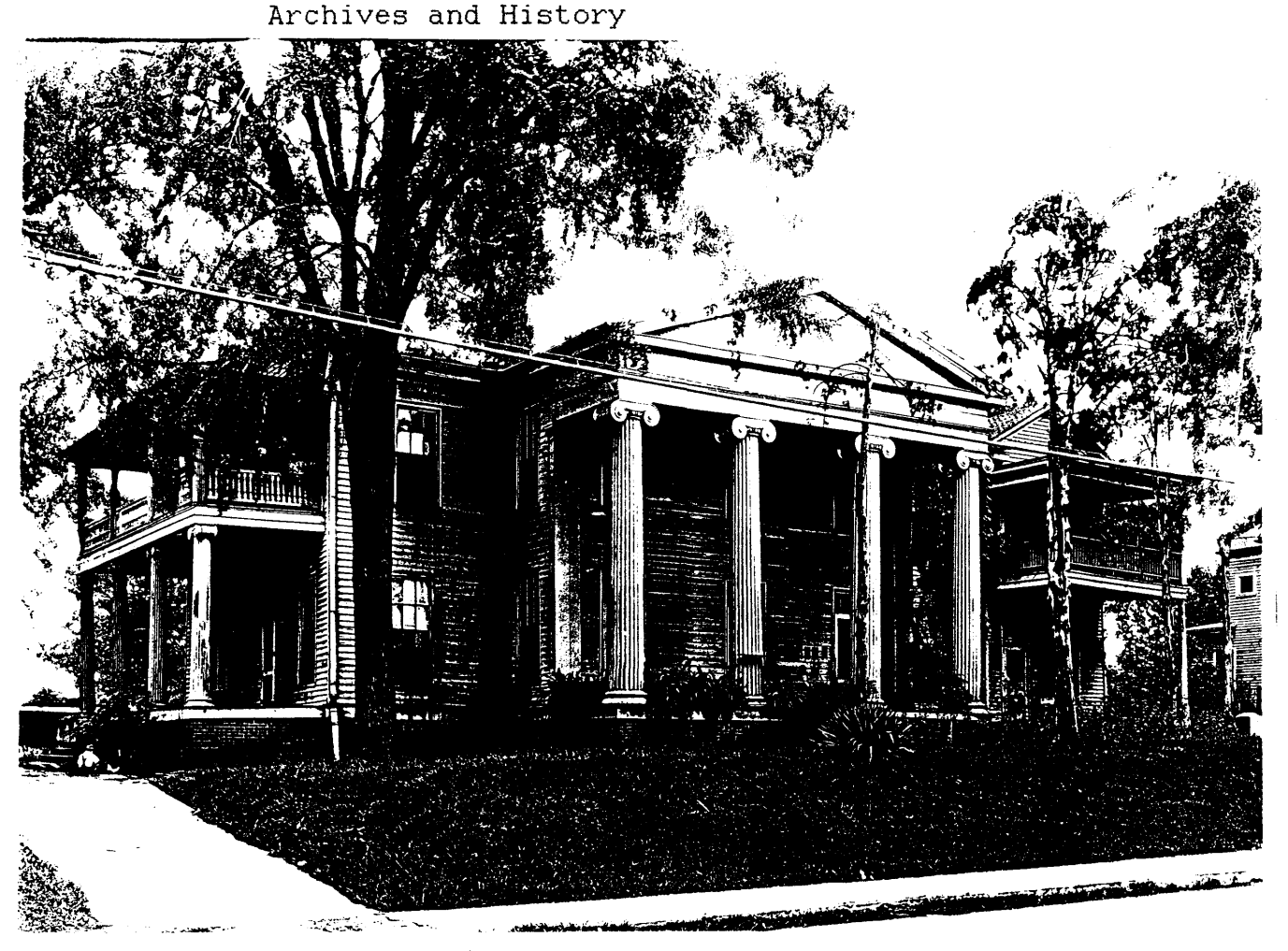
Historic View 1 of 2:

View of the Poindexter House following its removal in ca. 1902 to Robinson Street from its original location on the site of Poindexter Park. The house was demolished in the ca. 1950s.