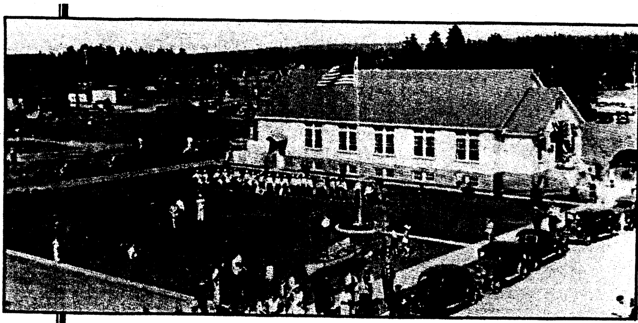
Cole Memorial 1939/1940