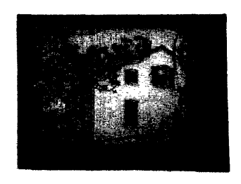
NW and SW elevs., looking NE

18. The historic front of the house faces a wooded ravine; today's entrance is through the frame infill which faces the gravel driveway.