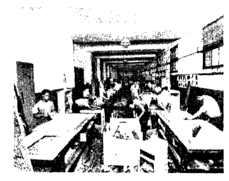
Cabinet making shop. c. 1939