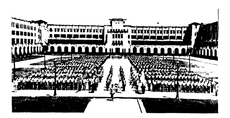
View of the interior courtyard. c. 1950

The open arcades and galleries on each floor define the main hierarchical space—the open courtyard—and connect all parts of the building and provide excellent horizontal circulation (Figure # 9). The central court and galleries provided cross ventilation to the individual cells. Vertical circulation was originally provided by stairways located in the central volumes of the west and east sections of the building. At a later date, additional stairs were constructed in each