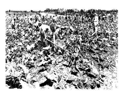
Prisoners tending the Penitentiary farm

Puerto Rico Insular Penitentiary San Juan, Puerto Rico