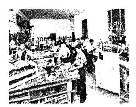
Toy making shop. c 1939

The first floor of the building was dedicated to administration offices, two schoolrooms, psychiatric hall, workshops, dinning hall (with capacity of 500) kitchen and bathrooms. The institution's workshops were located in this floor as well. The 332 cells were distributed in the second and third floors while the 12 wards, isolated one from the others, were located in the fourth floor. The wards were reserved for the prisoners of good conduct.