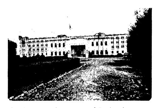
Roadway to main entrance of Penitentiary. c. 1939

This institution is equipped with modern devices to meet the exigencies of present criminology. It is located on an area of 112 acres of which approximately 70 acres will be dedicated to the raising of vegetables and other products. The main building, which consists of a four-story structure and other additional dependencies, including the land, cost the Insular Government the sum of $733,822.82, and $46,000 were expended in the purchase of equipment. With a view of making every possible economy all the necessary furniture was made by the prisoners at the Penitentiary shops. Every effort is being made to make this institution a self-supporting one. To achieve this end the prisoners are being taught industrial trades so that positions within the institution now filled by outside might be filled by them in the future. The farm products will be used in the maintenance of prisoners. This will substantially reduce the expenses incurred by the Government in the operation of the Penitentiary. <sup>14</sup>