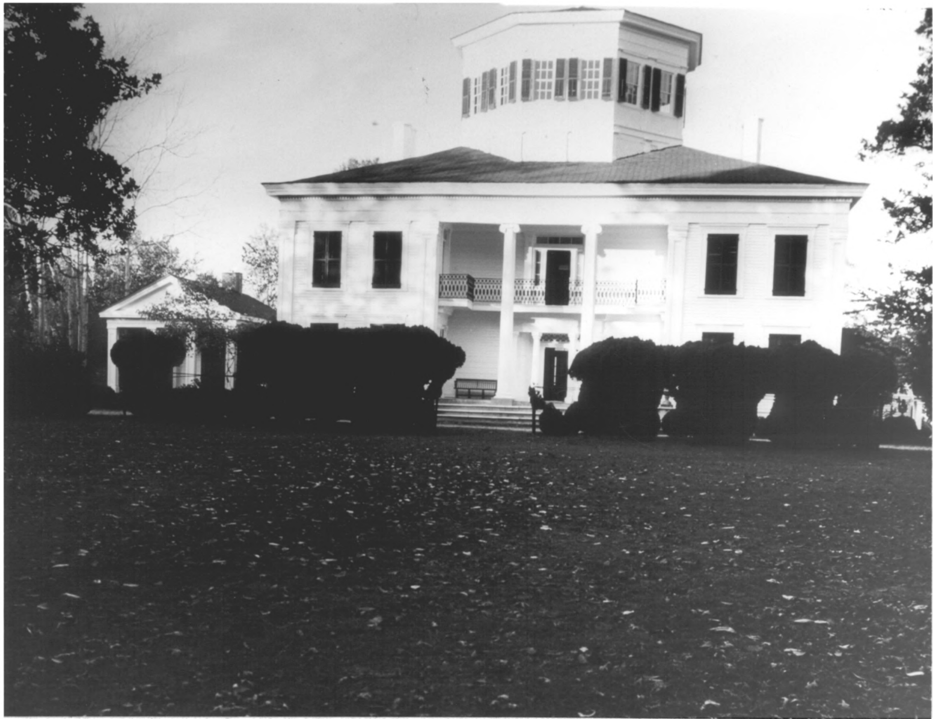
Waverley, Clay County, Mississippi