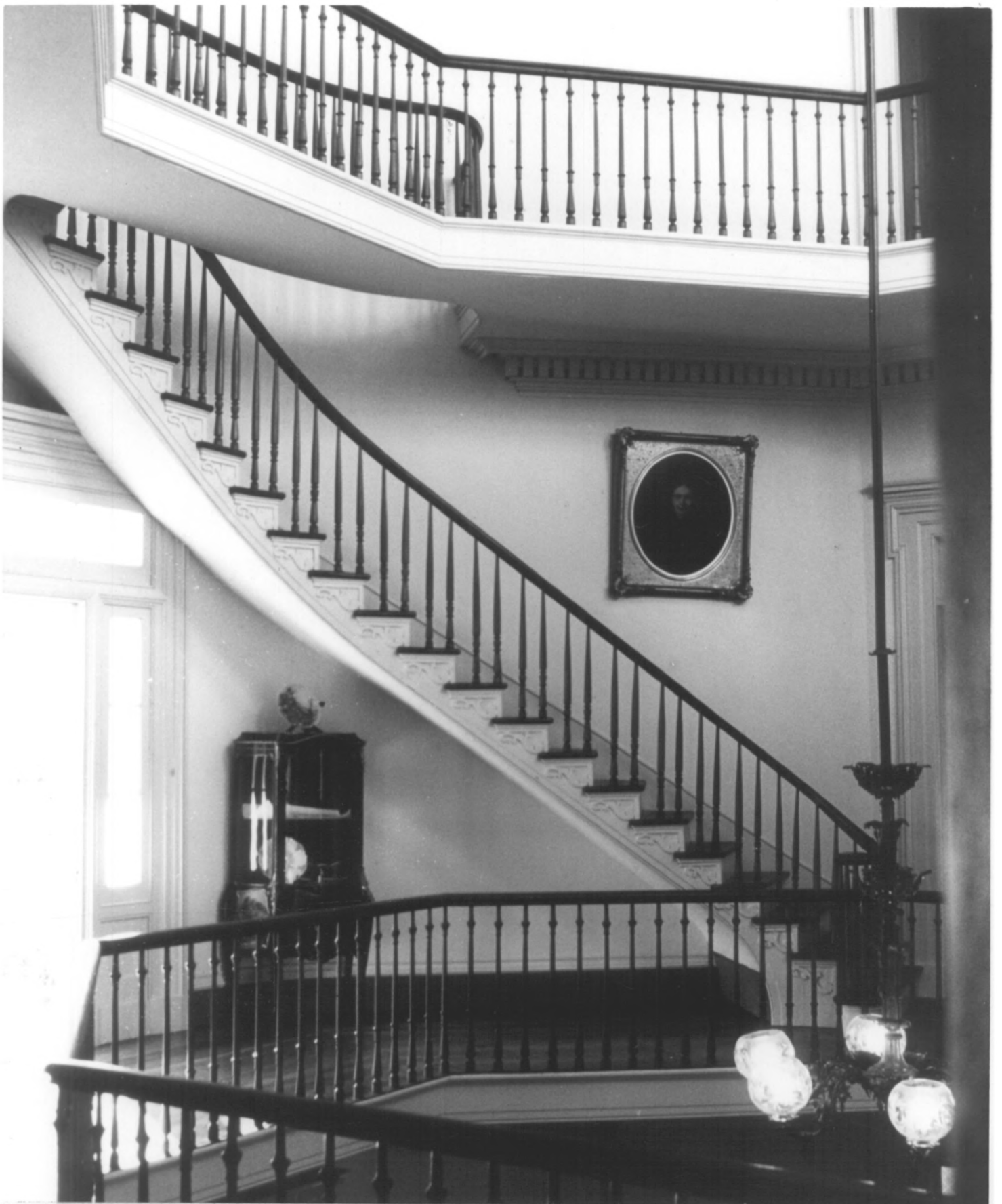
Waverley, Clay County, Mississippi