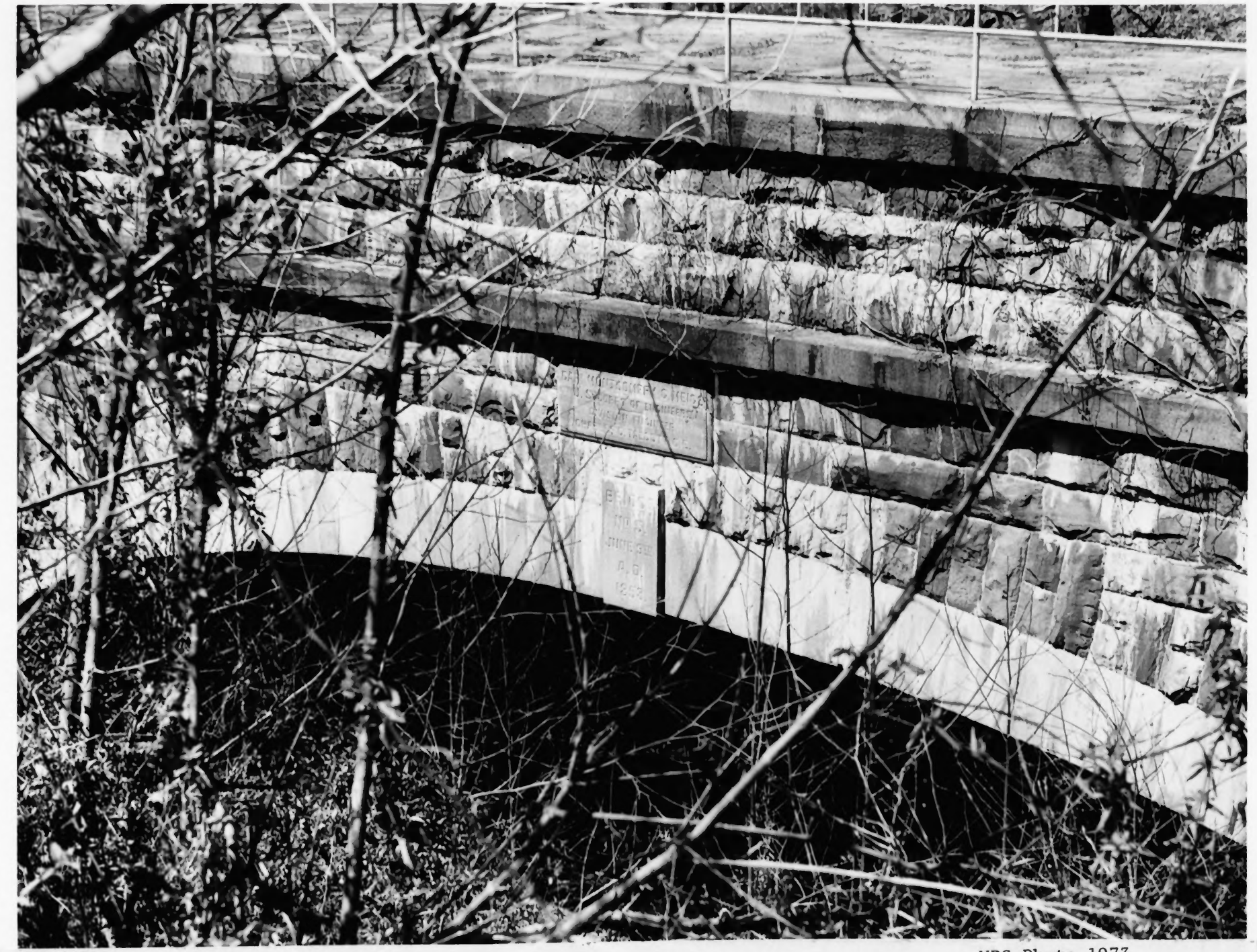
. Washington Aqueduct, Bridge No. 3, Washington, D.C.