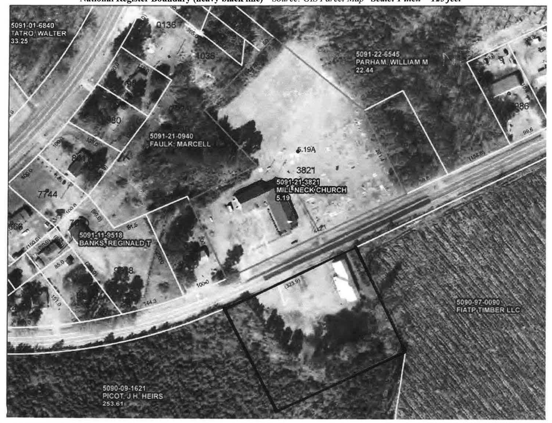
Mill Neck School, Como vicinity, Hertford County, NC National Register Boundary (heavy black line) Scale: 1 inch = 125 feet