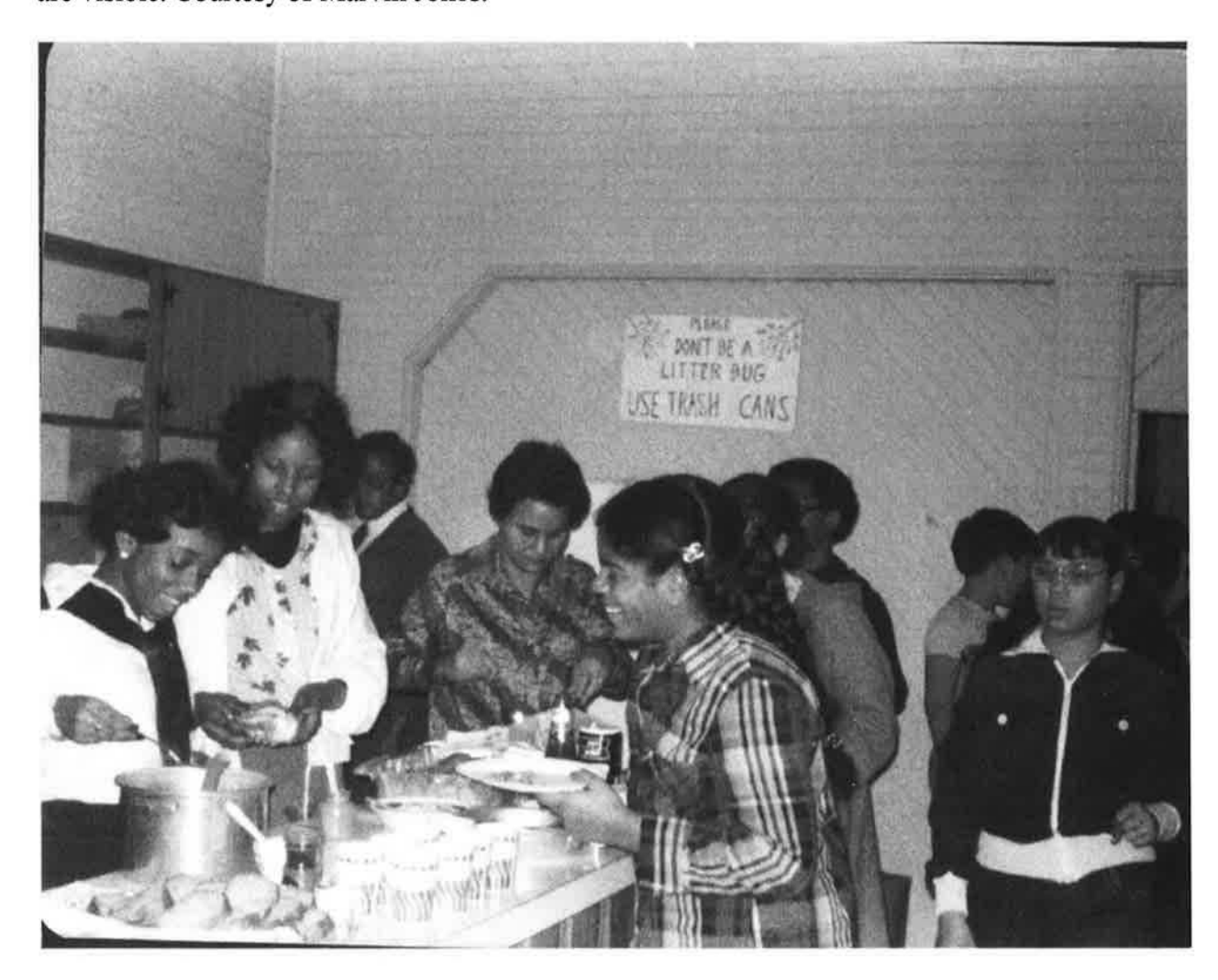
Figure #7 Teen social gathering in the front classroom, 1980s. The doors to the rear classrooms are visible.