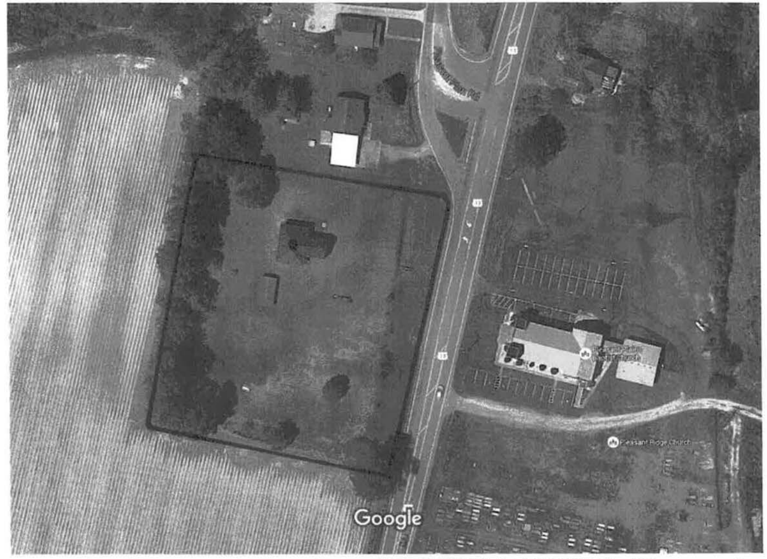
Imagery @2016 Google, Map data @2016 Google