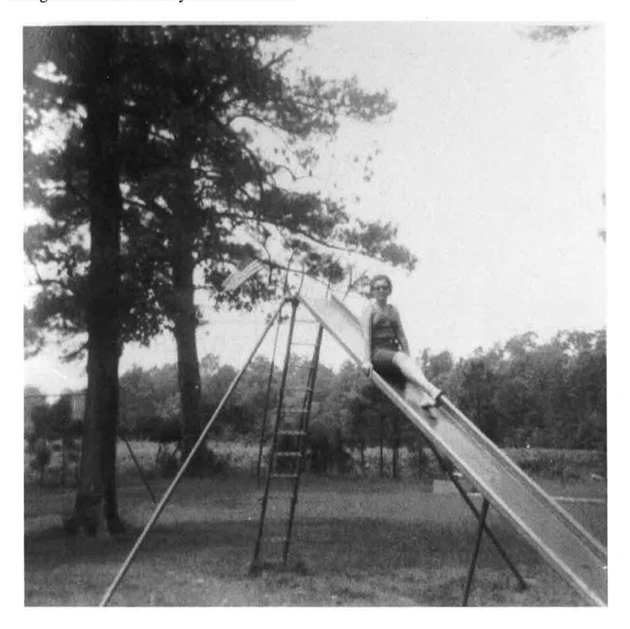
Figure #6 Lynell James on slide, Pleasant Plain Community Center playground, 1975. View facing south.