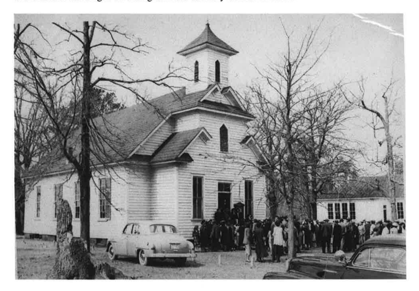
Figure #1 Pleasant Plains Baptist Church (built 1875, and remodeled in 1905) taken before 1945. The photo shows the church sitting south of the Pleasant Plains School. The south wall of the school building is on the right.