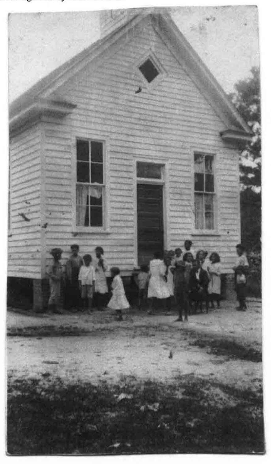
Figure # 2 Pleasant Plains School front/east façade, 1944. The photo is given courtesy of L. Lassiter. Digitized by Marvin Jones.