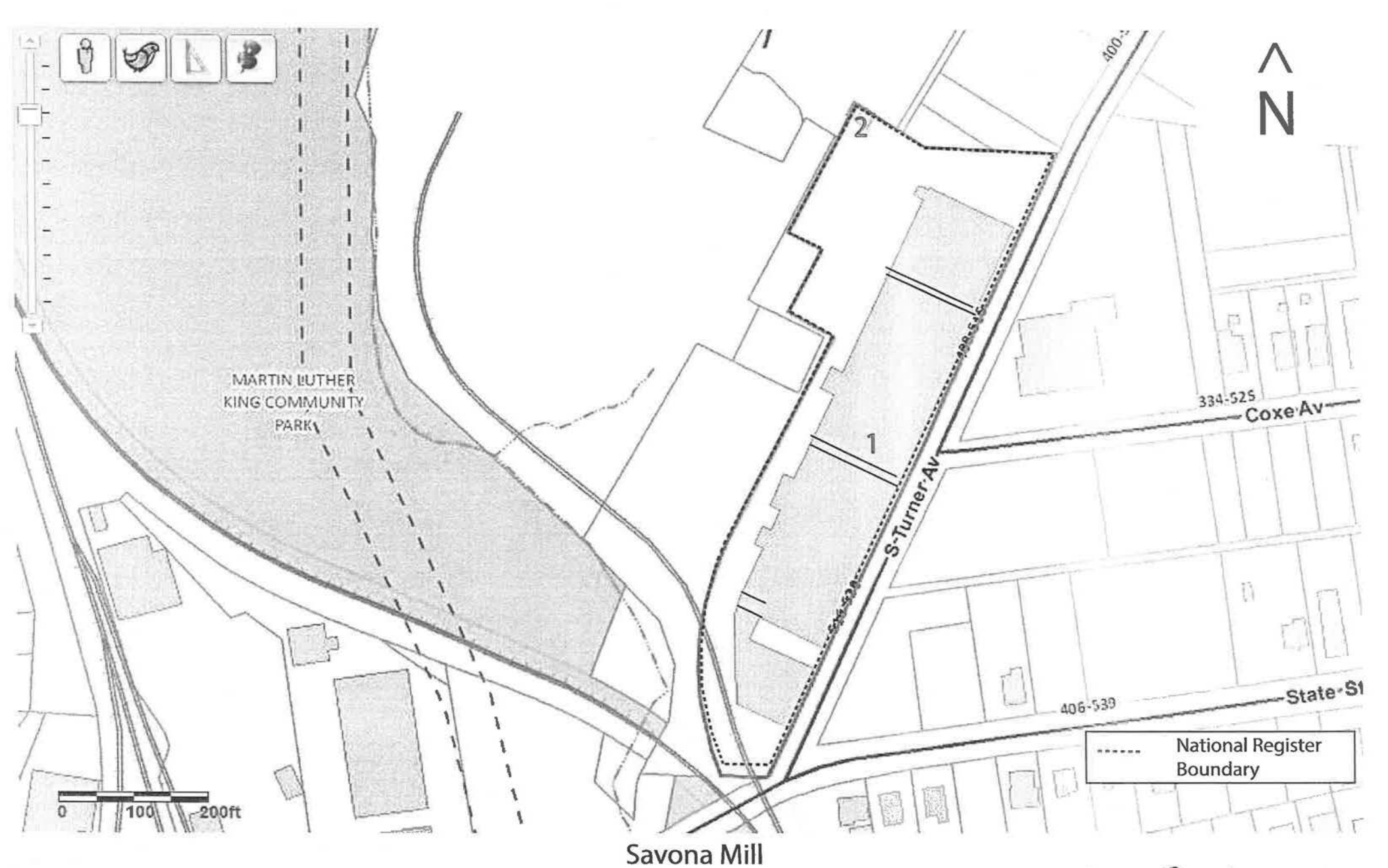
528 South Turner Avenue, Charlotte, NC Mecklenburg County National Register Nomination, September 2014 Site Map